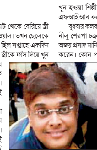
বেঙ্গালুরুতে ফ্ল্যাট কিনেছিলেন খুনের দিন কিছু বন্ধুকে ই-মেলে মোবাইলে নানা নম্বর বাড়াও-বিহারের