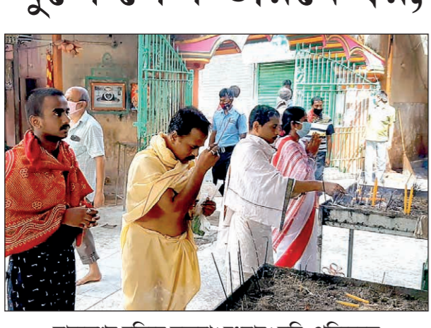
তারেকেশ্বর মন্দিরে ভক্তরা। বৃহবার।