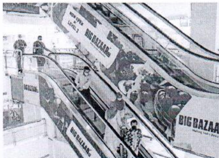
Amazon's petition in Delhi HC seeks enforcement of a Singapore-based arbitral tribunal order that stayed the sale of Future Group's retail assets to Reliance Retail.

The letter said that despite its pre-existing rights, if the lender banks' illegal and malicious insolvency proceedings against FRL are allowed, there will be no accountability