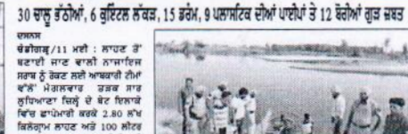
ਪੰਜਾਬ ਦੀ ਆਬਕਾਰੀ ਟੀਮ ਵਲੋਂ ਬੈਟ ਏਗੇਂਟ 'ਚ ਛਾਪੇਮਾਰੀ, 2.80 ਲੱਖ ਕਿਲੋਗ੍ਰਾਮ ਲਾਹਟ ਤੇ 100 ਲੀਟਰ ਨਾਜਾਇਬ ਸ਼ਰਾਬ ਕੀਤੀ ਨਸ਼ਟ।