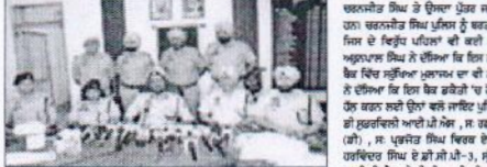
ਪਿਓ ਨੇ ਦੋ ਪੁੱਤਰਾਂ ਤੇ ਇਕ ਹੋਰ ਨਾਲ ਮਿਲ ਕੇ ਬੈਂਕ 'ਚ ਕੀਤੀ ਲੁੱਟ, ਦੋ ਕਾਬੂ ਤੇ ਪਿਓ ਦੀ ਭਾਲ ਲਈ ਛਾਪੇਮਾਰੀ ਜਾਰੀ।