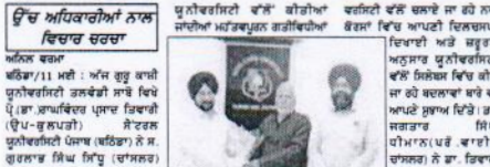
ਸੈਂਟਰਲ ਯੂਨੀਵਰਸਿਟੀ ਪੰਜਾਬ (ਬਠਿੰਡਾ) ਦੇ ਉਪ ਕੁਲਪਤੀ ਦਾ ਗੁਰੂ ਕਾਸ਼ੀ ਯੂਨੀਵਰਸਿਟੀ ਨਾਲ ਦੁੱਲਣ ਸਹਿਯੋਗ ਲਈ ਦੌਰਾ।