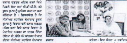
ਬੀਡੀਓ ਨੂੰ ਕੀਤਾ ਮੁਖਤਲਾਸ਼।

ਬੀਡੀਓ ਨੂੰ ਕੀਤਾ ਮੁਖਤਲਾਸ਼। ਬੀਡੀਓ ਨੂੰ ਕੀਤਾ ਮੁਖਤਲਾਸ਼।