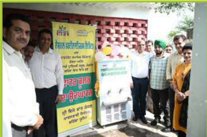
RO Water coolers distributed to Government Schools in villages near Bathinda