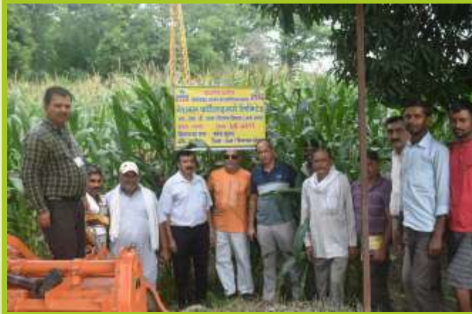
Demonstration of Bentonite Sulphur on Maize Crops at R&D Farm