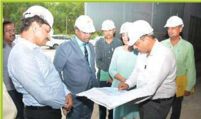
C&MD getting information on the setup plan of Nano Urea Plant