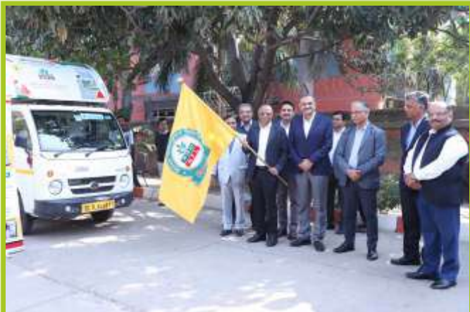
Directors and Senior officers flagging off the Digital Mobile Health Van from Corporate office, Noida