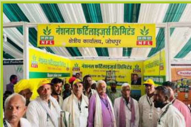
Farmers gathered at NFL's stall in a Krishi Mela