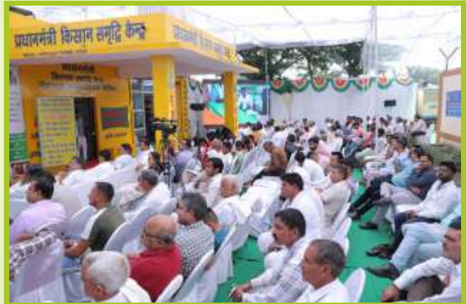
Farmers gathered at NFL Panipat PMKSK