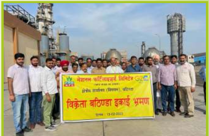
Visit of Dealers/Retailers to Bathinda Plant