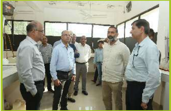
Director (Mark.) & Director (Fin.) during visit to Lab in PMKSK Bathinda