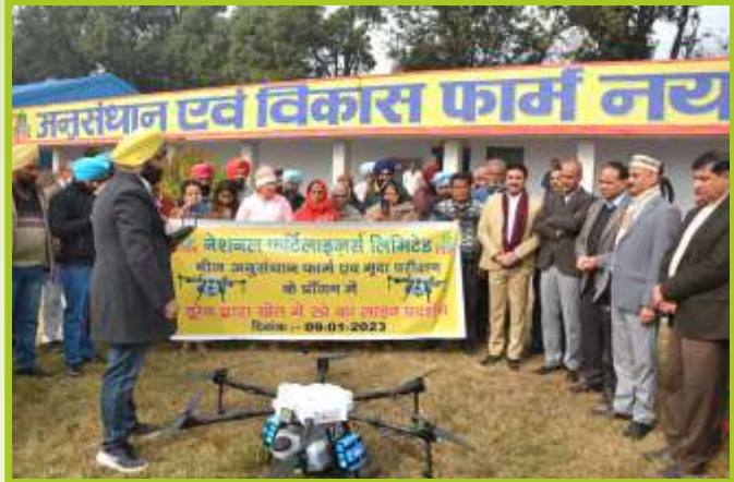
Demonstration of Drone at R&D Farm in Nangal Unit