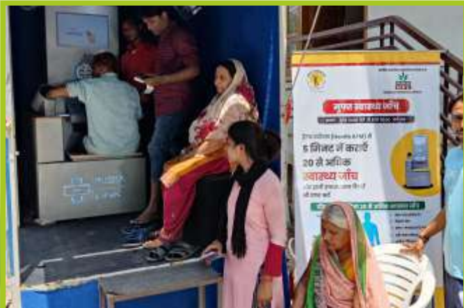
Beneficiaries at the Digital Mobile Health Van