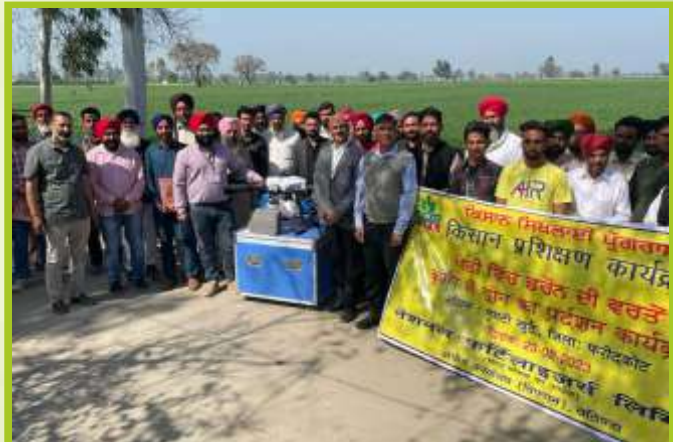
Demonstration of Drone at a Farm by NFL officials