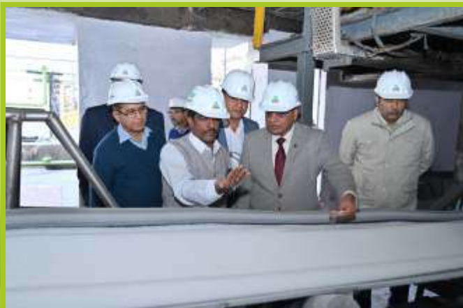
Independent Director inspecting Urea Prills during visit to Bathinda Plant