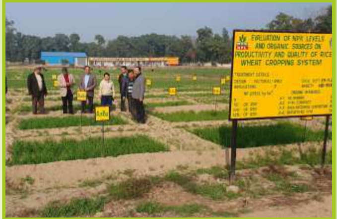
Demonstration of NPK & Organic sources on Rice Wheat Crops at R&D Farm