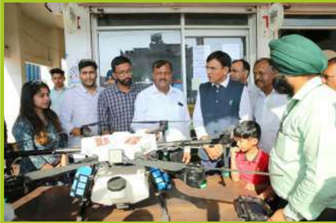
Hon'ble Minister of Chemicals & Fertilizers inspecting the farming drone at a NFL PMKSK