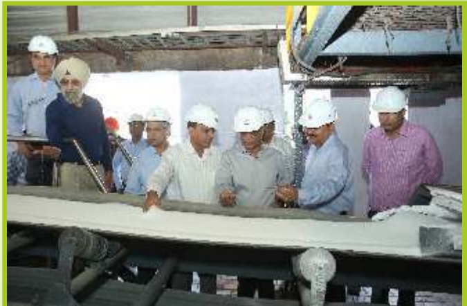
Director (Mark.) & Director (Fin.) inspecting Urea Prills in Bathinda Plant