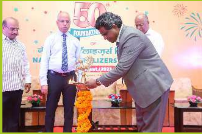
C&MD, Directors lighting the lamp on the occasion of 50 th Foundation Day of National Fertilizers Limited on 23 rd August, 2023