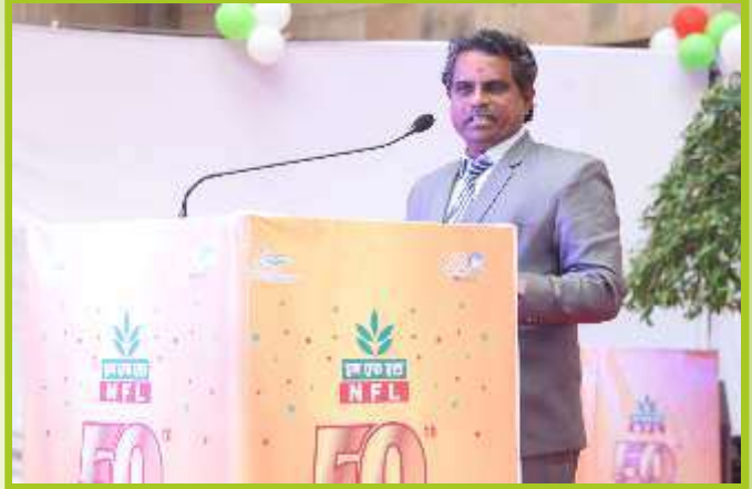
C&MD addressing the employees on 50 th Foundation Day