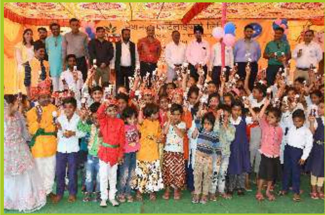
Student of Government schools in Raghogarh, Dist. Guna (MP) receiving free fortified milk everyday under CSR