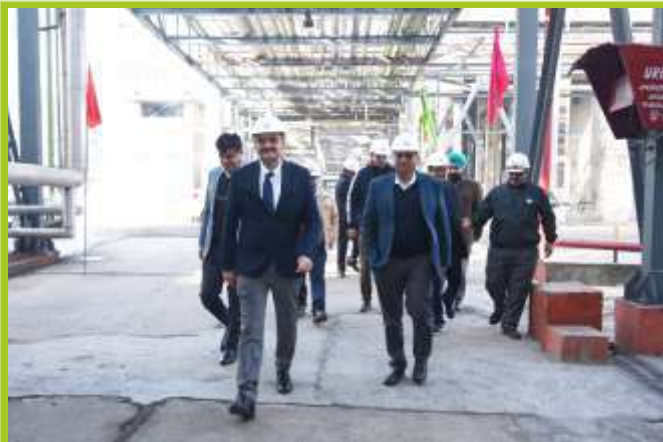
Director (Tech.) during visit to Bathinda plant with Sr. officers