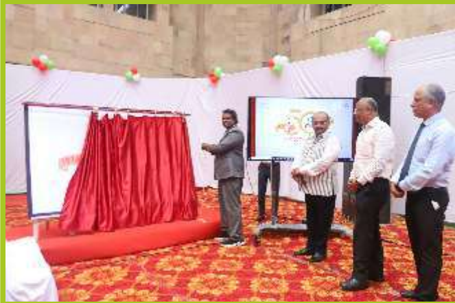
C&MD and Directors unveiling a special golden jubilee Logo on the occasion of 50 th Foundation Day of National Fertilizers Limited on 23 rd August, 2023