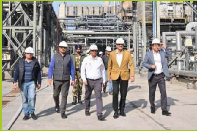
Director (Tech.) during visit to Bathinda plant with Sr. officers