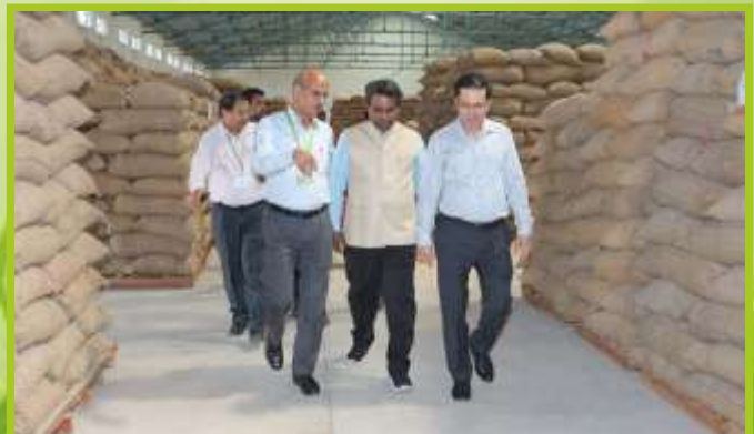
Chairman & Managing Director at Seed Processing Plant in Panipat