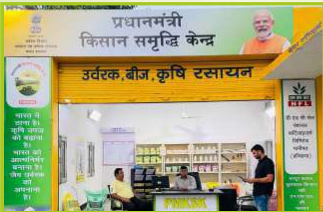
A view of PMKSK of NFL at Panipat