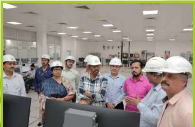
Independent Directors during visit to Panipat plant with Sr. officers