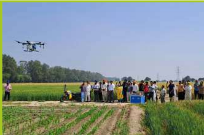
Demonstration of Drone at a Farm by NFL officials