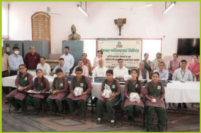
Sports items and brailers distributed to Institute for the Blind in Chandigarh