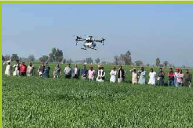
Demonstration of Drone at a Farm by NFL officials