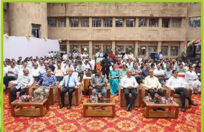
C&MD, Directors, Executive Directors, Sr. Officers and employees during the 50 th Foundation Day of celebration of NFL