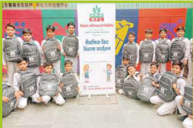
Free educational kit distributed to students of the Government Schools in New Delhi