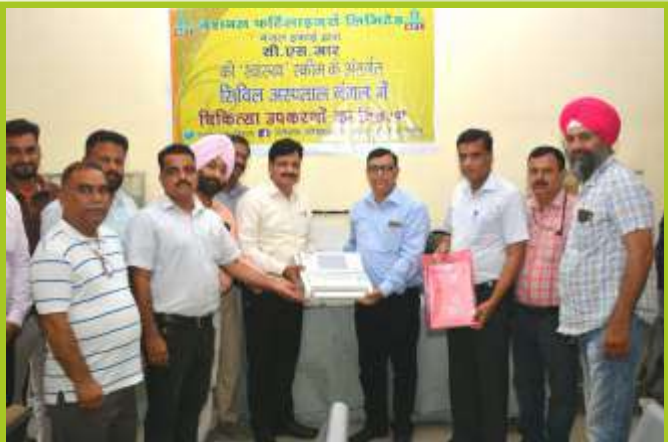
Medical equipments distributed to Civil Hospital, Nangal under CSR