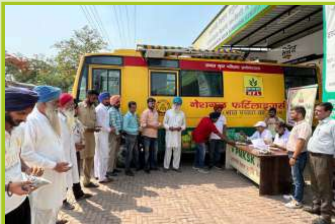
Farmers giving soil samples to NFL officials at a Mobile Soil Testing Van