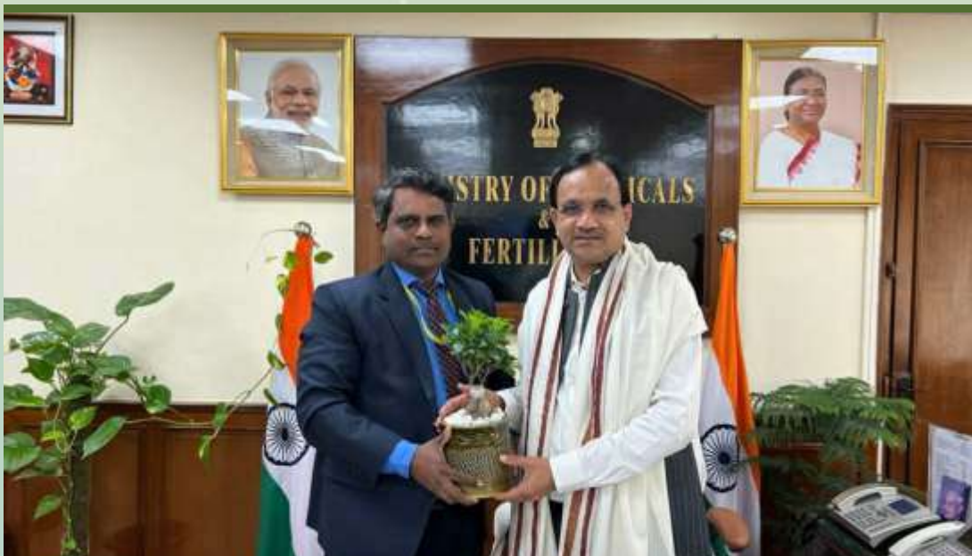
Shri U. Saravanan, C&MD greeting Sh. Bhagwanth Khuba, Hon'ble Minister of State for Chemicals & Fertilizers and New & Renewable Energy after taking over the charge as C&MD, NFL