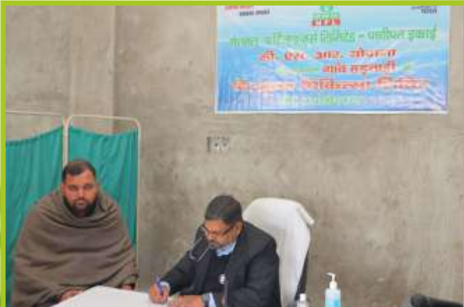
A view of free medical checkup camp organized in a village near Panipat