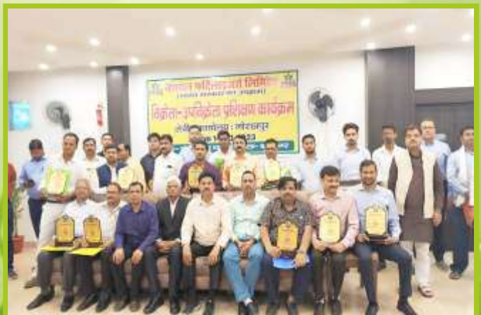
Dealers/Retailers facilitated in a training programme