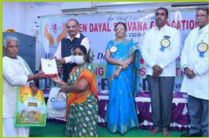
Distribution of Digital Hearing Aids to the underprivileged beneficiaries at a distribution camp organised in Vishakhapatnam, Andhra Pradesh