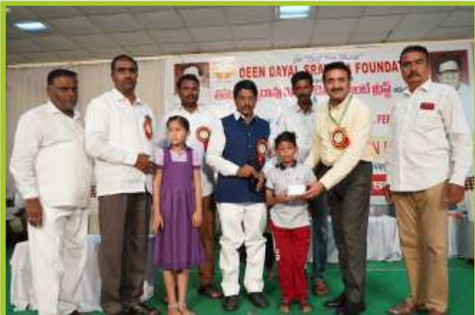
Distribution of Digital Hearing Aids to the underprivileged beneficiaries at a distribution camp organised in Kakinada, Andhra Pradesh