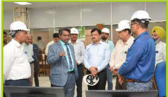
Chairman & Managing Director in GTG control room at Nangal Plant