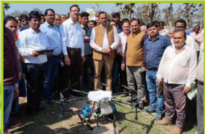
Demonstration of Drone at a Farm by NFL officials