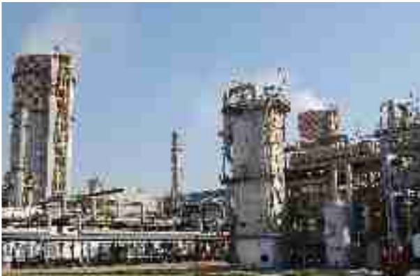
VIJAIPUR I & II PLANT