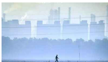
airways, weaker chest wall and less immature immune system. These make them more vulnerable to respiratory diseases."

that around 30.6% of the 2,682 children were exposed to hazardous air pollution. Around 25% of the children were from economically weaker sections and lived in kutcha houses.