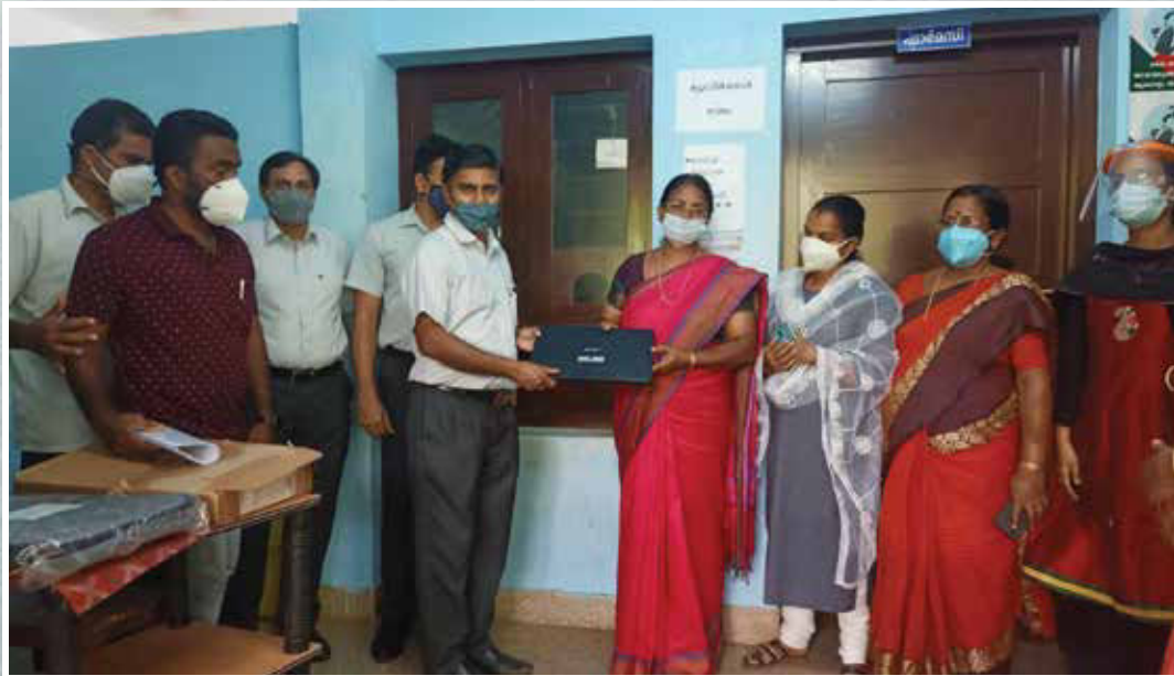
Donating Laptop to Public Health Centre , Kathikudam to support Covid vaccination for public