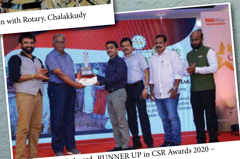
Receiving KMA Award -RUNNER UP in CSR Awards 2020 – Environment & Greenery Category.