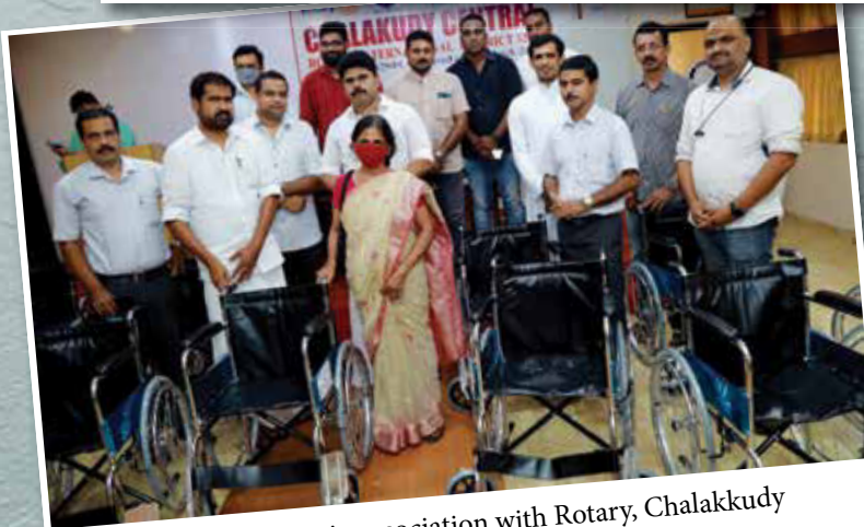
Donating wheel chairs in association with Rotary, Chalakkudy