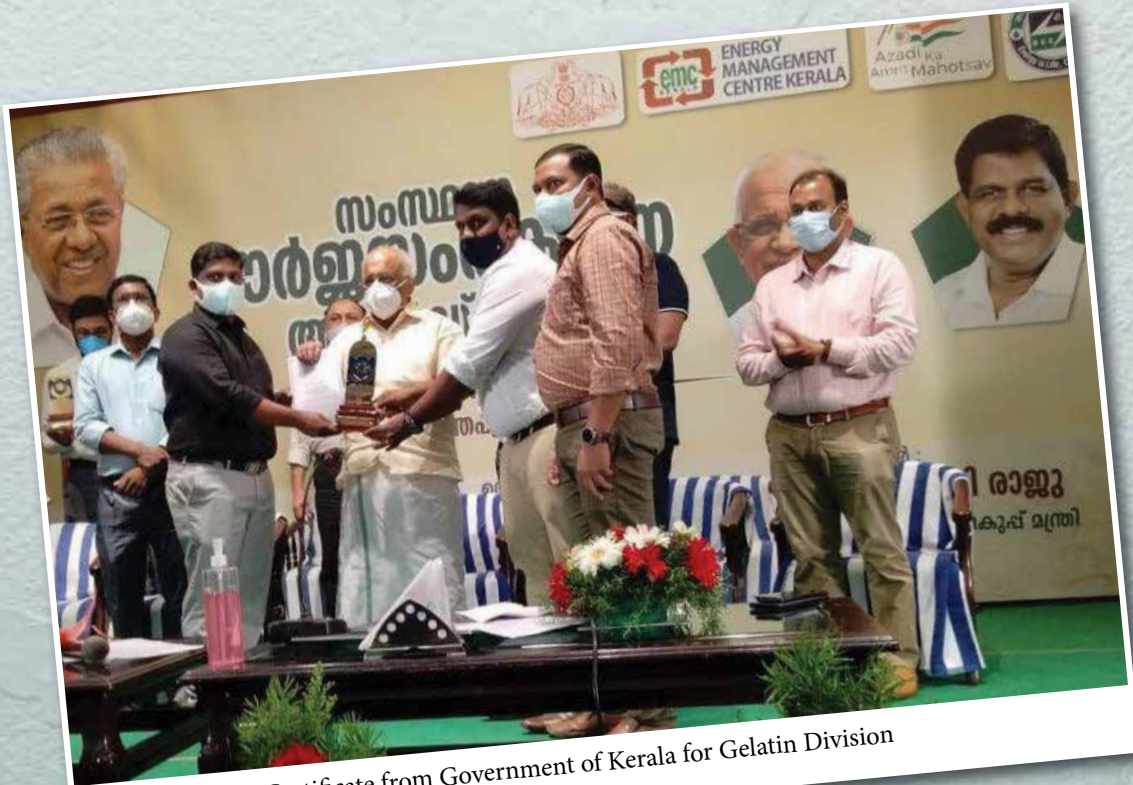
Commendation Certificate from Government of Kerala for Gelatin Division