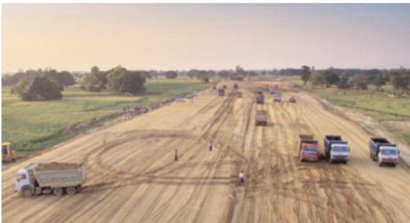
The state has employed a GPS-based monitoring system for projects to preempt time and cost overruns

The remaining ₹11,000 crore will be incurred on projects in the villages,