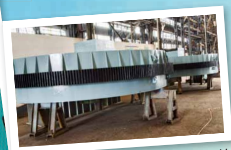
End Ring With Sector Gear Assembly