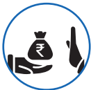
Anti Bribery Anti Corruption Policy