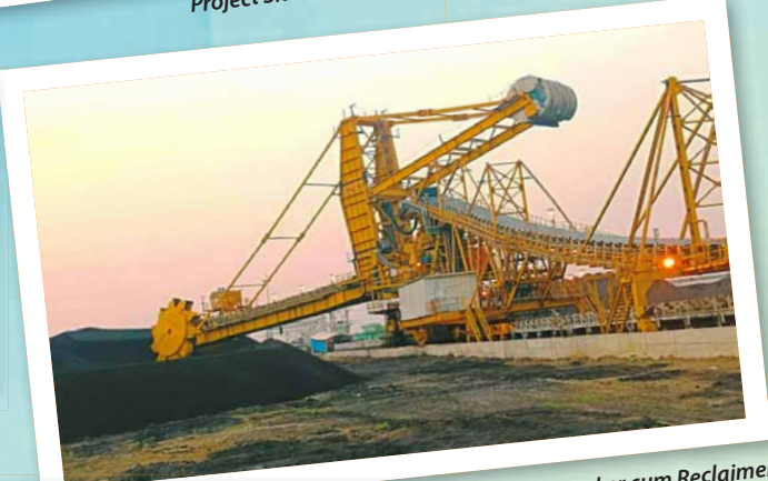
Stacker cum Reclaimer