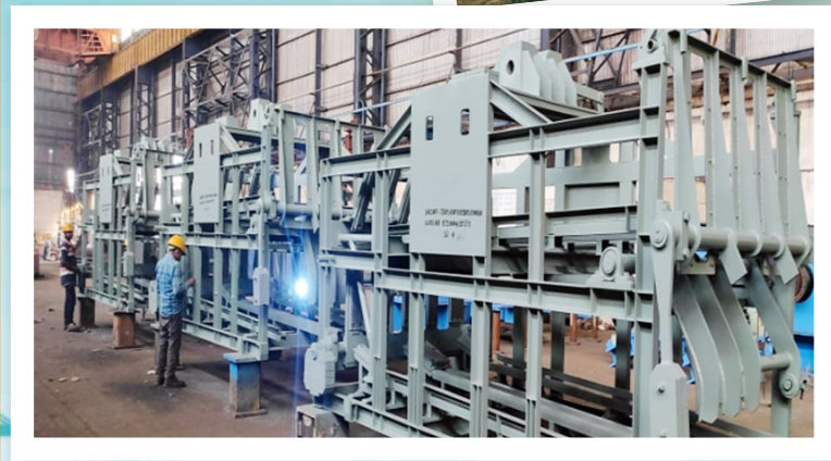
Sleeve Loading System