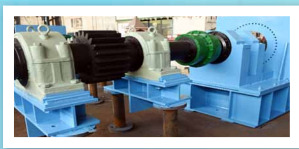
Drive Unit Assembly