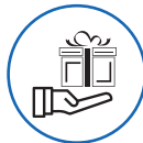
Gift and Hospitality Policy