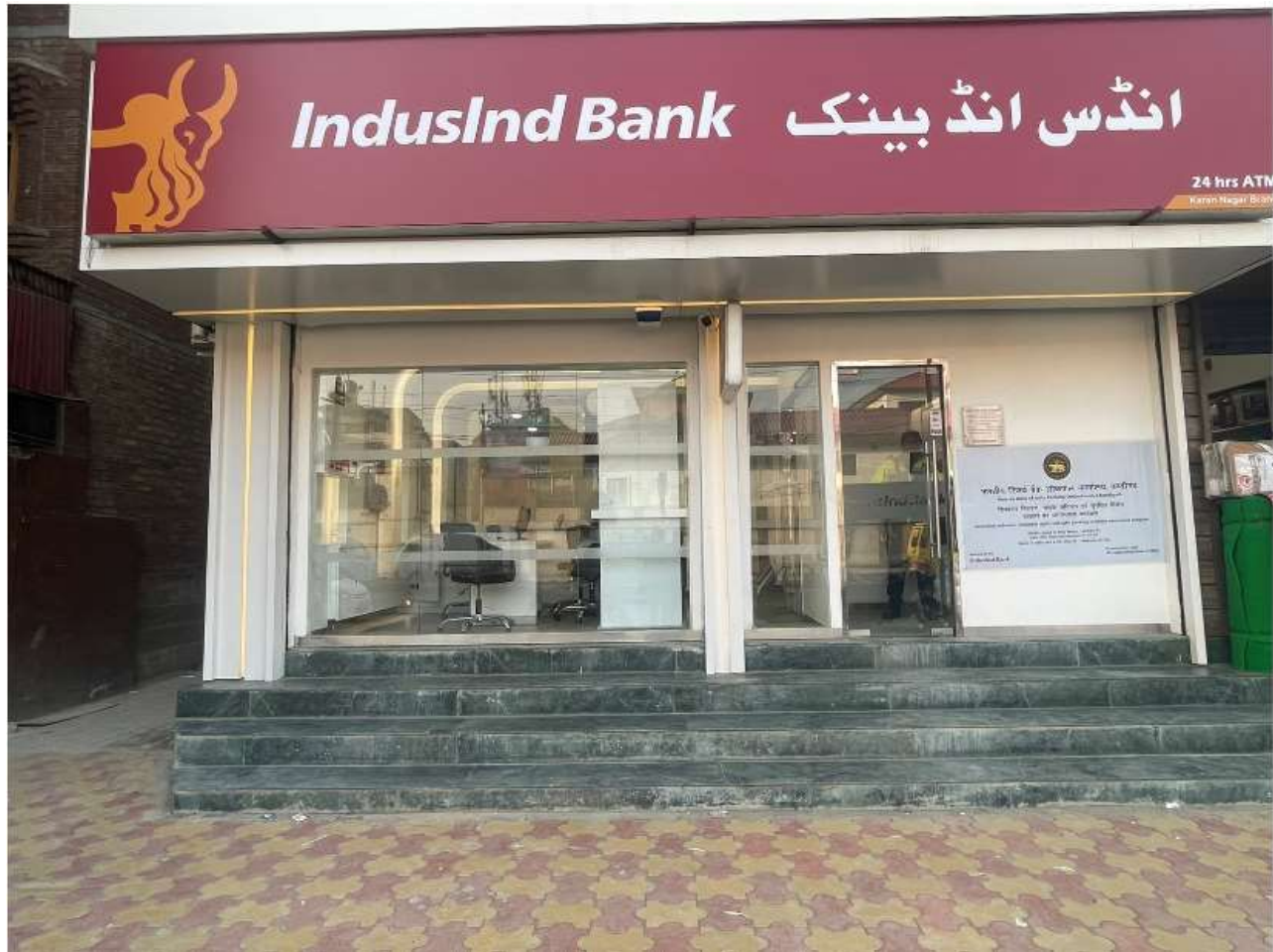
Photo caption - Photo of IndusInd Bank's newly inaugurated branch at Karan Nagar, Srinagar, J&K.