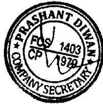
PRASHANT DIWAN SCRUTINIZER