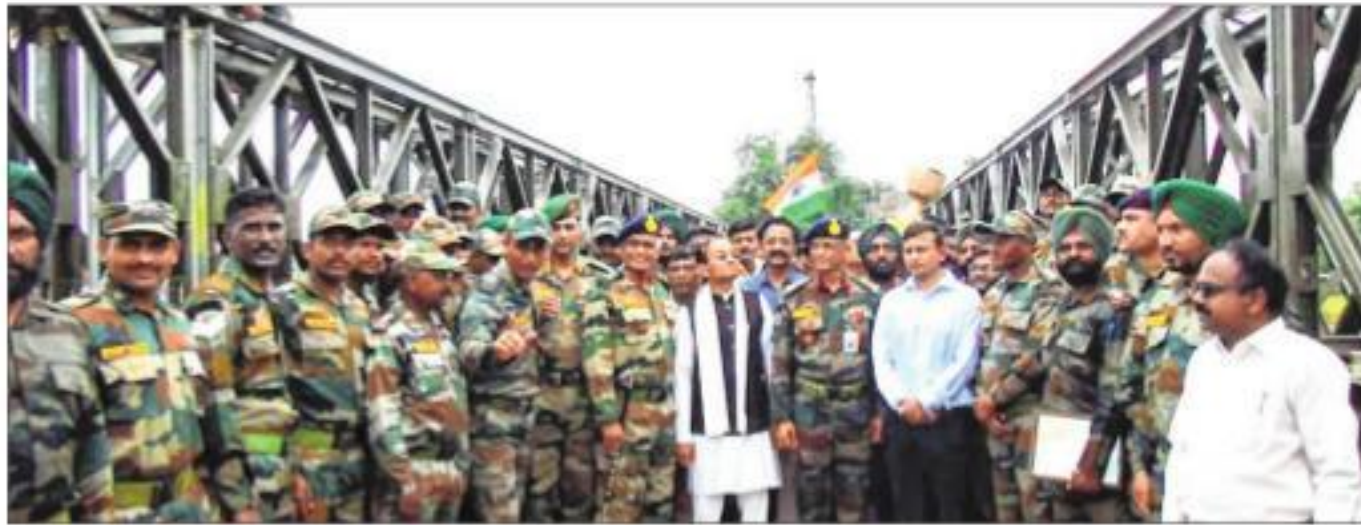
Army has made a bridge of such a specification, which is an achievement in itself.

The construction of bridge started on August 26. It was opened to traffic on Wednesday. This is the first time in state that Indian