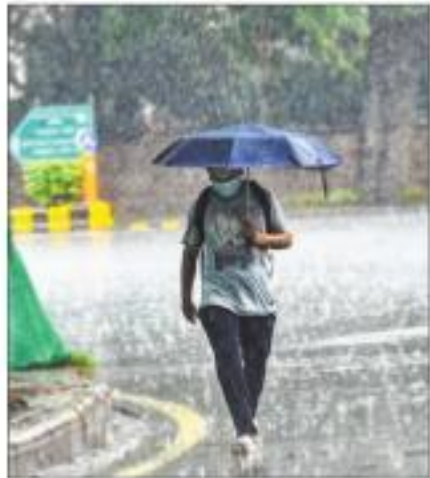
in Bhopal on Wednesday noon as clouds appeared causing light rain at many places. It provided relief from humidity. Temperatures soared in the state capital after rain stopped few days back.

The weather condition is unlikely to change till September 3. Weather changed