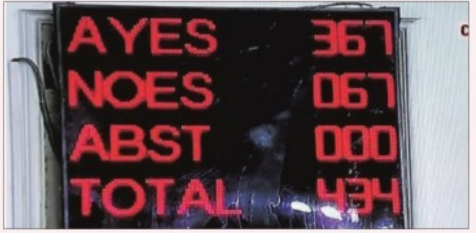
The Lok Sabha on Tuesday cleared the statutory resolution ending Jammu & Kashmir's special status

THE GOVERNMENT DECISION to bury Article 370 and bifurcate Jammu and Kashmir into two Union Territories of J&K and Ladakh was ratified by Parliament Tuesday when Lok Sabha too gave its