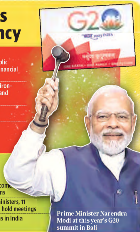
Prime Minister Narendra Modi at this year's G20 summit in Bali

Two exhibitions in Delhi: India as mother of democracy and digital transformation