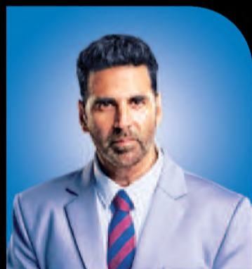
AKSHAY KUMAR ACTOR