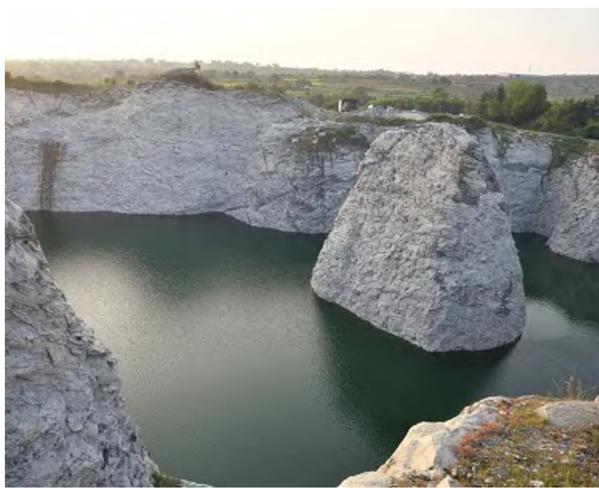
Gaping void: Many quarries have over-extracted, and many have operated illegally after expiry of environmental clearance and without the consent to operate. A quarry at Koratagiri in Denkanikottai in Krishnagiri district.

Koratagiri's collective grievance was the same as any village affected by quarries. Its primary waterbody, Sanathkumar lake, and the check-dam feeding its livestock and crops contaminated by quarry dust; stone dust settling on community grazing land; premature death of livestock; jamming of