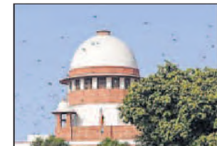
Four new benches to take up cases related to four distinct branches of law.

It was in 2015 that the Supreme Court, under then CJI HL Dattu,