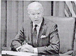
with which it no longer has a mutual defence treaty, instead maintaining a policy of "strategic ambiguity" about how far it would be willing to go if China invaded. The 1979 Taiwan Relations Act, which has governed US relations with the island, does not require the US to step in militarily to defend Taiwan if China invades, but makes it American policy to ensure Taiwan has the resources to defend itself and to prevent any unilateral change of status in Taiwan by Beijing.

President Joe Biden said on Monday that the US would intervene militarily if China were to invade Taiwan, saying the burden to protect Taiwan is "even stronger" after Russia's invasion of Ukraine. It was one of the most forceful presidential statements in support of self-governing Taiwan, Biden said at a news conference in Tokyo, saying "yes" when asked if he was willing to get involved militarily to defend Taiwan if China invaded. "That's the commitment we made," he added. The US traditionally has avoided making such an explicit security guarantee to Taiwan,