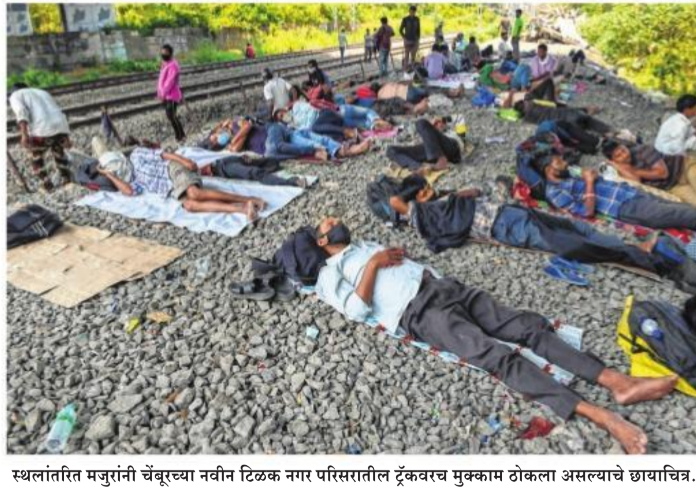
स्थलांतरित मजुरांनी चेंबूच्या नवीन टिळक नगर परिसरातील ट्रॅकवरच मुक्काम ठोकला असल्याचे छायाचित्र.