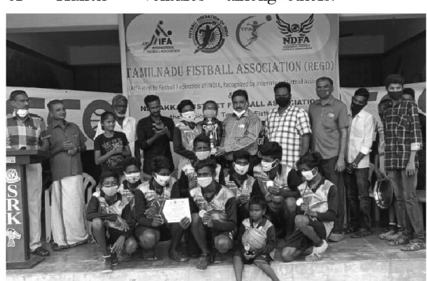
Men's champions Namakkal team.