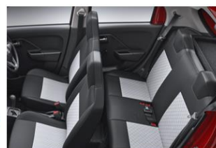
Pre-tensioner and force limiter front seatbelts