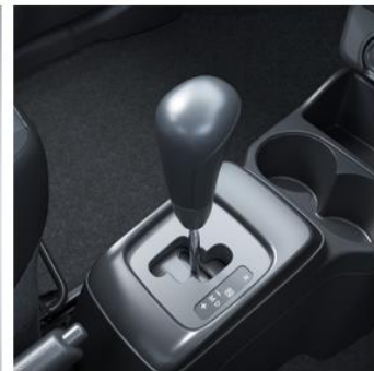
Excellent fuel-efficiency# of up to 24.90km/l with Auto Gear Shift

The All-New Alto K10 is available with both 5-speed Manual and Automatic Gear Shift (AGS) transmission options. The AGS transmission in the All-New Alto K10 offers enhanced driving comfort and convenience to consumers.