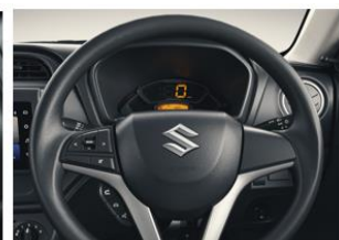
Steering Mounted Audio & Voice Control