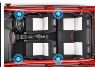
1 st in segment 4 speakers