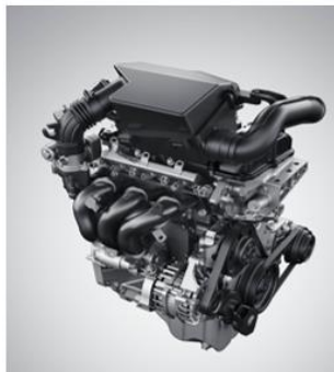
Next-Gen K-Series 1.0L Dual Jet, Dual VVT engine for peppy performance

Powered by the Next-Gen K-Series 1.0L Dual Jet, Dual VVT engine, the All-New Alto K10 delivers 49kW(66.62PS)@5500rpm of peak power and 89Nm@3500rpm of max torque. This state-of-the-art peppy, lively & efficient K-series 1.0L engine offers an exciting & fun to drive experience. Packed with cutting edge technology, the All-New Alto K10 will provide excellent fuel-efficiency# of 24.90 km/l (AGS) and 24.39 km/l (MT).