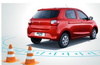
Reverse Parking Sensors