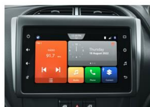
SmartPlay Studio with Smartphone Navigation