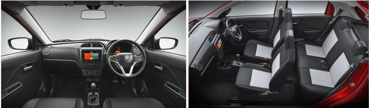
Ergonomically designed, lively & spacious interiors with center focused dashboard design, floating audio unit and premium accentuation