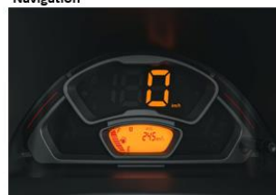
Digital Speedometer Display