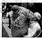
of Medical Research (ICMR) for Covid-19 testing.