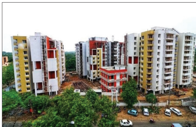
Construction of 222 Flats at Keelandev Tower, Bhopal for MP Housing & Infrastructure Development Board.

among others) only, minimizing much of the risk. The Company has in-house laboratories and engineers for quality checks. Work-in-progress checks are carried out during execution. The Company has its own quarrying & mining, concrete and bituminous divisions and engineering personnel to ensure quality execution. Finished quality checks are carried out post-execution to ensure quality of the final product before handing over the works to the clients.