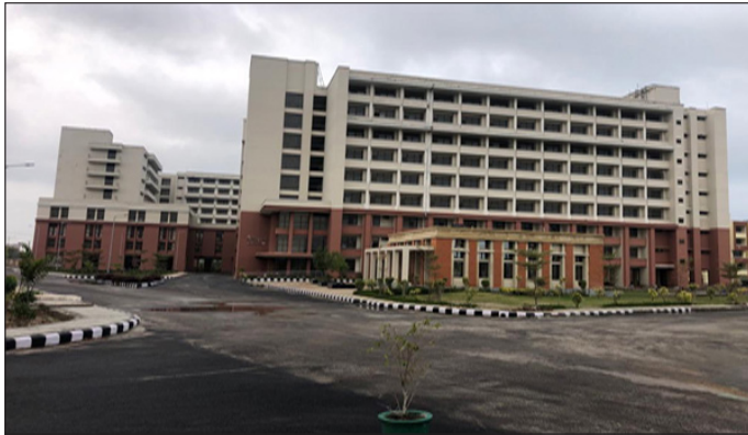
Construction of National Law University, Rai in Sonapat District, Haryana for PWD (B & R), Haryana

world. The Central Government's emphasis on road infrastructure, energy, railways and affordable housing is expected to create numerous opportunities for MBL. We have displayed an inherent ability to explore and capitalize on opportunities presented across the entire infrastructure spectrum.