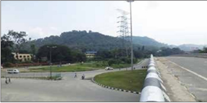
Widening & Strengthening of existing National Highway from 2 lane to 4 lane of Sonapur to Guwahati section of NH-115 (earlier NH 37) for NHAI.

implementing agencies such as State PWDs, NHAI, and NHIDCL and funds are provided for construction of ROBs/RUBs like other National Highways Projects.