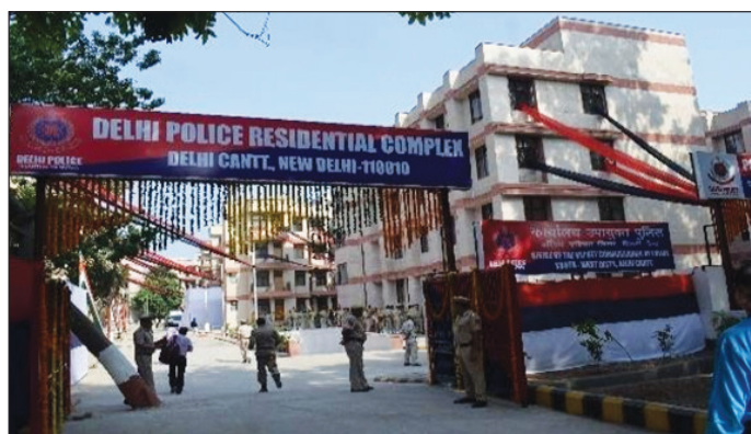
Police Station & Police Colony, Delhi Cantt. for MHA, Delhi Police through RITES Ltd.