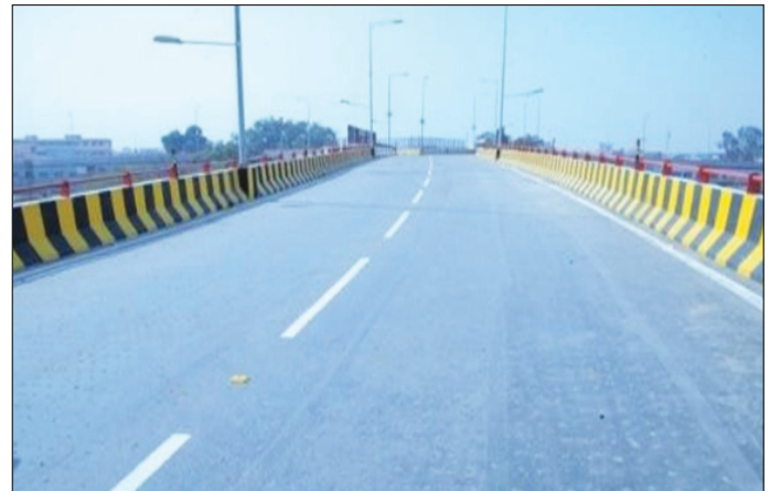
Construction of 2 lane Railway overbridge at Sonepat for Haryana State Roads and Bridges Development Corporation Ltd.

Waterways, and Logistics Infrastructure are the seven engines that propel PM Gati Shakti. The National Highways Network is expected to be expanded by 25000 kilometres, with a budget of Rs. 20000 crore (US$ 2.67 billion) set out for the project in FY 2022-23. Every infrastructure project is expected to route through the network planning group (NPG) constituted under this initiative. Various other government initiatives such the National Infrastructure Pipeline, National Monetisation Pipeline, Bharatmala Pariyojana, changes in the Hybrid Annuity Model (HAM) and fast pace of asset monetization would also boost road construction.