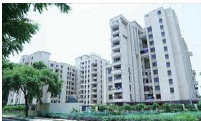
Residential accommodation for NHAI staff at Sector 17, Dwarka, New Delhi.

The total income of the Company during the Financial year 2021-22 was Rs. 16148 lakhs on standalone basis and Rs. 26047 lakhs on consolidation basis as against Rs. 26009 lakhs on standalone basis and Rs.32234 lakhs on consolidation basis during FY 2020-21. The Company had profit after tax of Rs.6359 lakhs on standalone basis and profit of Rs. 13 lakhs on consolidation basis during FY 2021-22 as against profit of Rs. 9334 lakhs on standalone basis and profit (including exceptional items) of Rs. 6337 lakhs on consolidation basis during FY 2020-21.