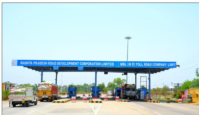
Strengthening, Widening, Maintaining and Operating 18.303 kms Waraseoni-Lalbarra Road in the state of Madhya Pradesh

of structural and procedural reforms, record vaccinations, various PLI schemes designed to attract investments, Make-in-India programme to boost domestic manufacturing capacity, reduction of corporate tax rate, etc and steps to improve operational efficiency have helped the economy to grow.