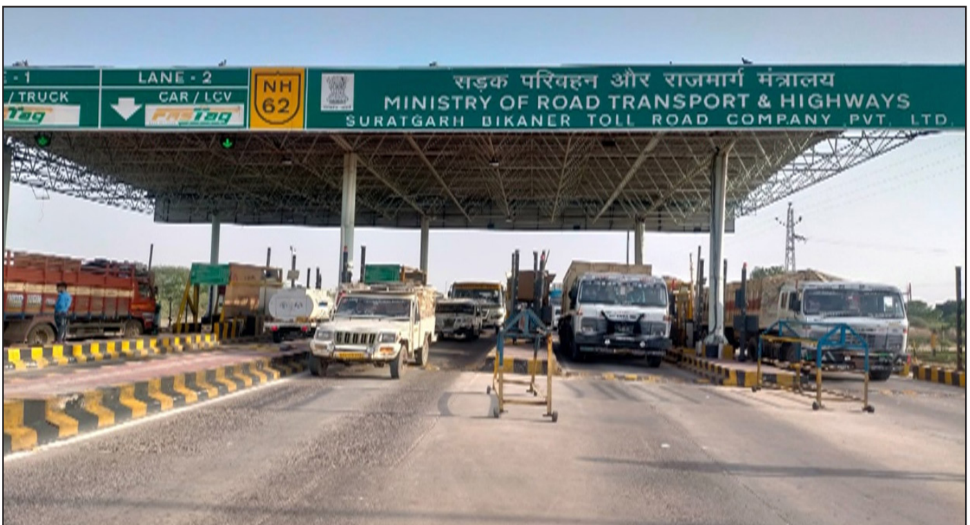
Development & Operation of Bikaner-Suratgarh Section of NH-62 (earlier NH-15) in the state of Rajasthan for Ministry of Road Transport & Highways through PWD, Rajasthan (PCOD-96.54%).

India has undertaken a number of reforms, such as formalisation of its economy, incentivising domestic manufacturing, digitalisation, import substitution, increasing exports which has helped in providing flexibility to the government in terms of monetary policy. With an improvement in the economic scenario, there have been investments across various sectors of the economy. The Indian economy is poised to grow at a quick pace backed by various initiatives taken by the government. Initiatives under Atma Nirbhar Bharat including introduction