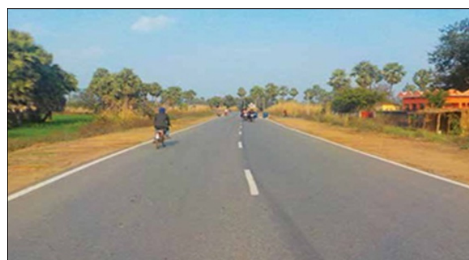
Improvement/Upgradation of roads and bridges of Shivganj-Rafiganj-Goh-Uphara-Devkund-Baidrabad Road (SH-68), Package 1 for Bihar State Road Development Corporation Ltd.

Economic activity will be driven by investment, with public investment playing a catalytic role. Infrastructure creates significant economic stimulus even compared to other forms of spending. The outlay of capital expenditure has increased by 35.40% from Rs 5.54 lakh crore in FY 21-22 to Rs 7.50 lakh crore in FY 2022-23. The effective capital expenditure of the government is estimated to be Rs 10.68 lakh crores in FY 2022-23, which will be about 4.1% of GDP.