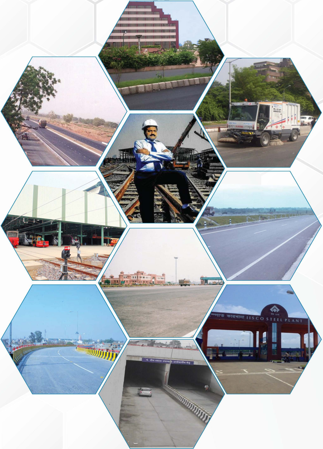
Some of completed projects