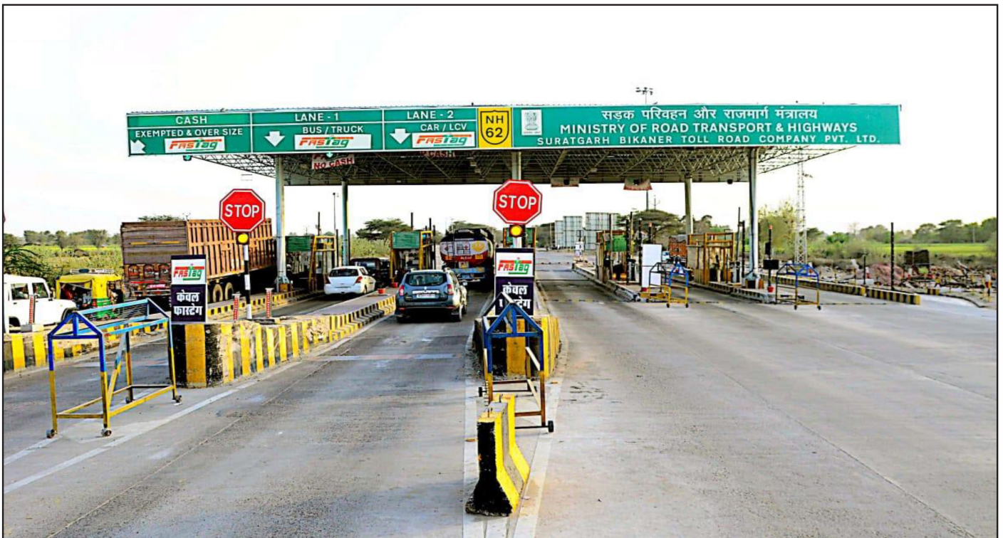
Development & Operation of Bikaner-Suratgarh Section of NH-62 (earlier NH-15) in the state of Rajasthan for Ministry of Road Transport & Highways through PWD, Rajasthan (PCOD-96.54%).