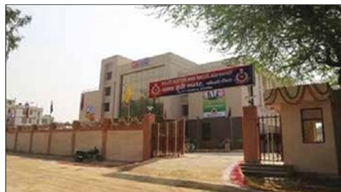
Construction of Police station & Residential Quarters, Hari Nagar, Delhi for MHA, Delhi Police through RITES Ltd.

We recognize the importance of human values and ensure that proper encouragement, both moral and financial, is extended