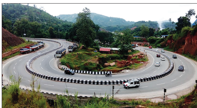
Widening & Strengthening of existing National Highway from 2 lane to 4 lane of Sonapur to Guwahati section of NH-115 (earlier NH 37).

India has a road network of about 63.72 lakh km which is second largest in the world. National Highways have a total length of 1,40,995 km which serve as the arterial network of the country. Government of India is responsible for development and maintenance of the National Highways and has taken major initiatives to upgrade and strengthen National Highways. National Highway development programmes through various phases, Bharatmala Pariyogna, SARDP-NE etc are some of the initiatives taken by Government of India. These projects are executed through NHAI, MoRTH and through state PWD/state corporations. The Road Transport Sector accounts for about 87% of passenger traffic and 60% of freight traffic movement in the country. National Highways constitute about 2.21% of the total road network, but carry about 40% of the total road traffic. In union Budget 2022-23, government of India has allocated Rs 199 lakh crores to the Ministry of Road Transport & Highways.