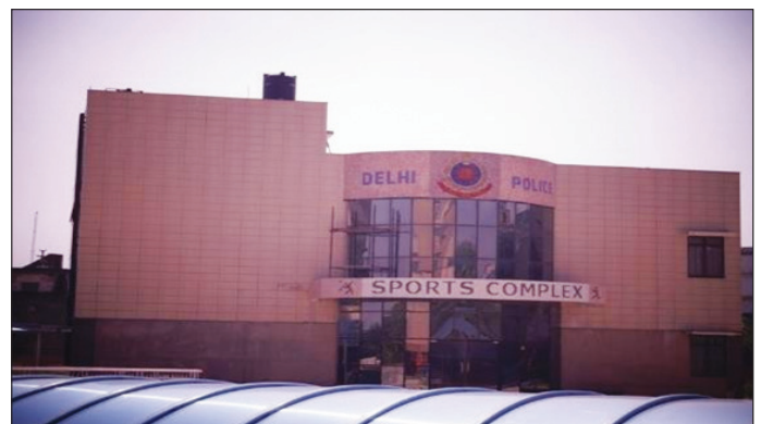
Police Station & Residential Quarters at Kondli, New Delhi for MHA, Delhi Police through RITES Ltd.