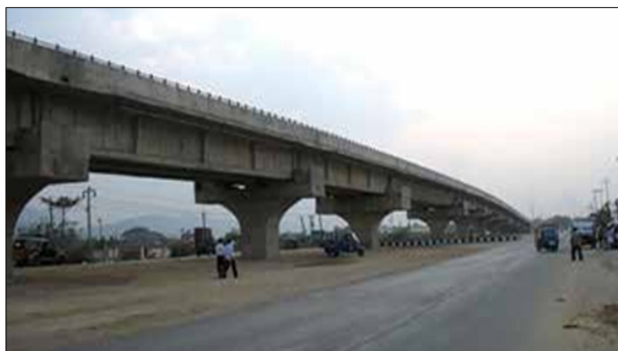
Widening & Strengthening of existing National Highway from 2 lane to 4 lane of Sonapur to Guwahati section of NH-115 (earlier NH 37) for NHAI

part of Phase I of Bharatmala Pariyojana, 22 Greenfield Corridors are being developed with length 8,409 km and total capital cost of Rs. 3,60,000 Cr. The government has emphasized on the development of National Highways in the North-Eastern Region and 10 per cent of the total budget allocation is earmarked for North Eastern region. The total length of National Highways in North-East is 13,651 Km and these are being developed and maintained by four Agencies- the State PWDs, BRO, NHAI and NHIDC.