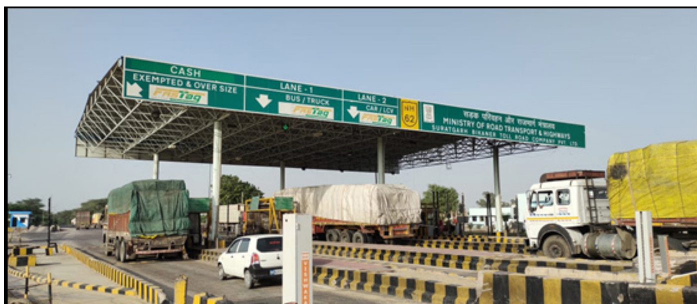
Development & Operation of Bikaner-Suratgarh Section of NH-62 (earlier NH-15) in the state of Rajasthan for Ministry of Road Transport & Highways through PWD, Rajasthan (PCOD-96.54%).