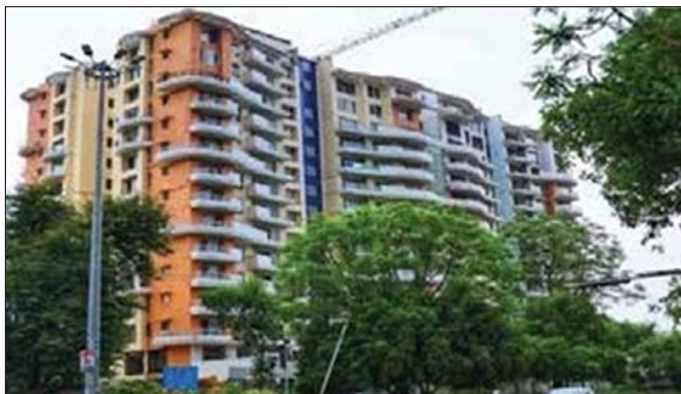
Construction of 96 flats at Tulsi Tower, Bhopal for MP Housing & Infrastructure Development Board

7.1 In new business models like BOT, revenue accrues to the contractor at a later date in the form of user-fees or toll. It is risky if the toll collected is insufficient to compensate the contractor with reasonable profits.