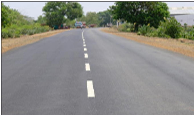
Strengthening, Widening, Maintaining and Operating 18.303 kms Waraseoni-Lalbarra Road in the state of Madhya Pradesh

Entering Amrit Kaal, the 25 year long lead up to India @100, the budget provides impetus for growth along four priorities: (i) PM GatiShakti (ii) Inclusive Development (iii) Productivity Enhancement & Investment, Sunrise opportunities, Energy Transition, and Climate Action (iv) Financing of investments. Increased government expenditure is expected to attract private investments, with a production-linked incentive scheme providing excellent opportunities.