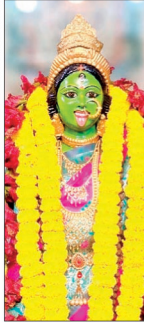
অধিকারী পরিবারের সবুজ কালী।

প্রীতিপূর্ণ পটিকা ঘনাই এই সবুজ কালীর নিম্নেই এখন পুরো প্রান্তিকি তুমিলে। পুজোটা হয় কালীর পরিবারের উদ্দেশ্যে। এবার এই পুজোর ৭৪ অর্থাৎ গায়ের ৯৪ হরিণাবাদের কলাপাতার মধ্যে। হরিণাবাদের