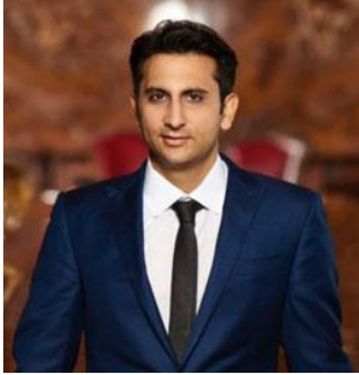
Mr. Adar Poonawalla appointed Chairman