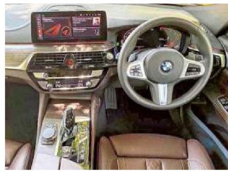
the spare wheel takes up a lot of space.

The cabin also gets a choice of trim elements to opt for depending on the variant. My test mule sported matt-finished wood inserts, brushed aluminium highlights and a 3-spoke, multiple-function M Sport steering wheel with paddle shifters. Space available in the cabin is good and there is more attention to the comfort of rear passengers in the new 6 GT. Four-zone climate control, a 9-degree incline for the rear seat backrest and powered privacy sheers for rear windows. The boot is large, but