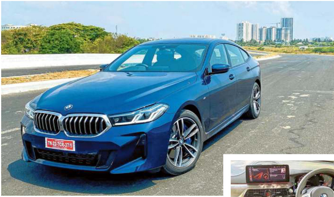
The new 6 GT's kidney grille seems to have grown in size just a notch and it continues to be one of the sportiest looking GTs from the side

Externally, the new 6 GT looks like a facelift, alright. Its profile and stance remains largely unchanged. What you see in these pics is the M Sport trim variant of the 630d - BMW speak for the diesel in-line 6-cylinder version of the 6 GT. The car's profile remains the same, though individual elements get updates, like the sportier front and rear fenders, the sharper angles for the LED DRLs and the light signatures in the headlamps, the 19-inch M Sport alloy wheels, and the trapezoidal tail-pipe ends at the rear. The new 6 GT's kidney grille seems to have grown in size just a notch and it continues to be one of the sportiest looking GTs from the side. The curved roofline slopes down sharply from the B-pillar to the edge of its notchback end. The GT tailgate is hinged high on the roof