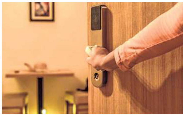
Unlike the national lockdown, hotels are continuing to operate but following safety protocols and local restrictions