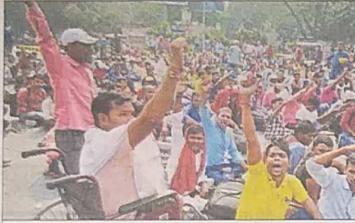
रेलवे भर्ती में अनियमितता के विरोध में दो दिनों से दिव्यांग अभ्यर्थी मंडी हाउस साईकिल में धरने पर बैठे हैं। इससे गुरुवार को भी जाम लगा रहा।

रेलवे भर्ती में अनियमितता को लेकर मंडी हाउस पर प्रदर्शन कर रहे दिव्यांग अभ्यर्थी गुरुवार को भी सड़क पर डटे रहे। ये सभी को नौकरी मिलने तक हटने को तैयार नहीं है, जबकि प्रशासन फिलहाल 50 फीसदी अभ्यर्थियों को नौकरी देने का आश्वासन दे रही है। बताते हैं कि वे रेलवे में हूँ भर्ती में अनियमितता का आरोप लगा रहे हैं। उनके प्रदर्शन के कारण जाम लग रहा है। गुरुवार को सुबह से ही सिकंदरा रोड और भगवानदास रोड बाहनों के लिए बंद कर दिया गया।