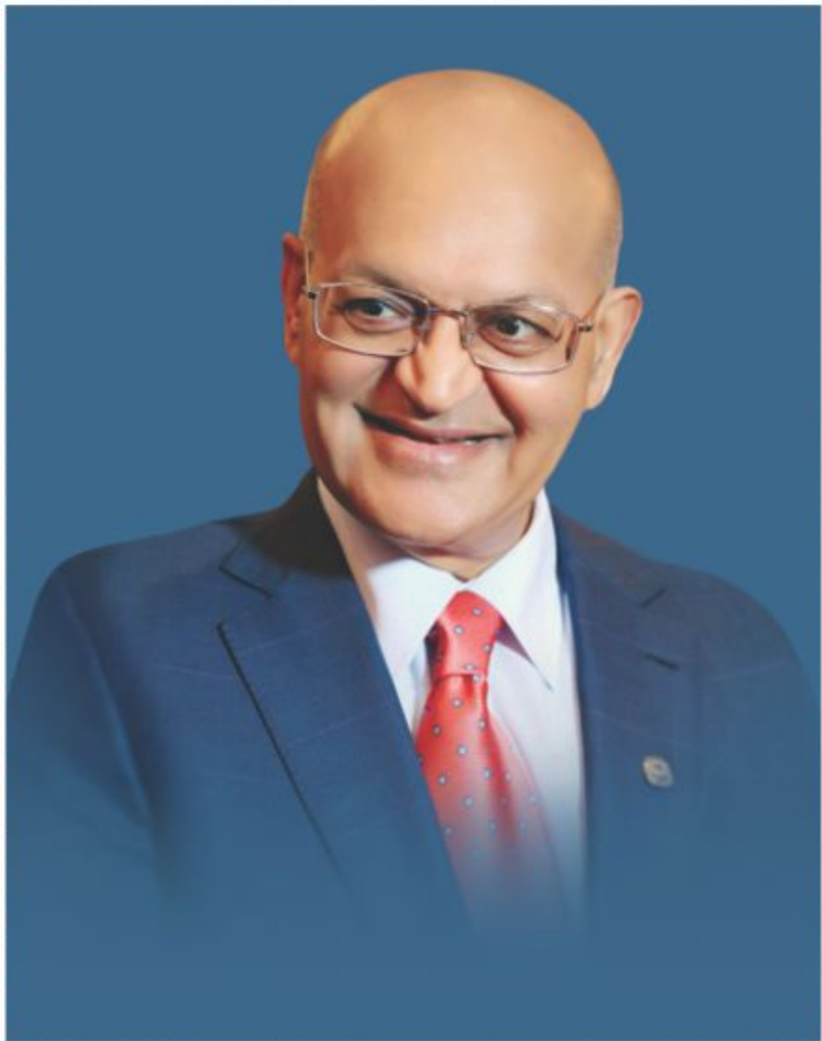
Hon'ble Shri Abhey Kumar Oswal