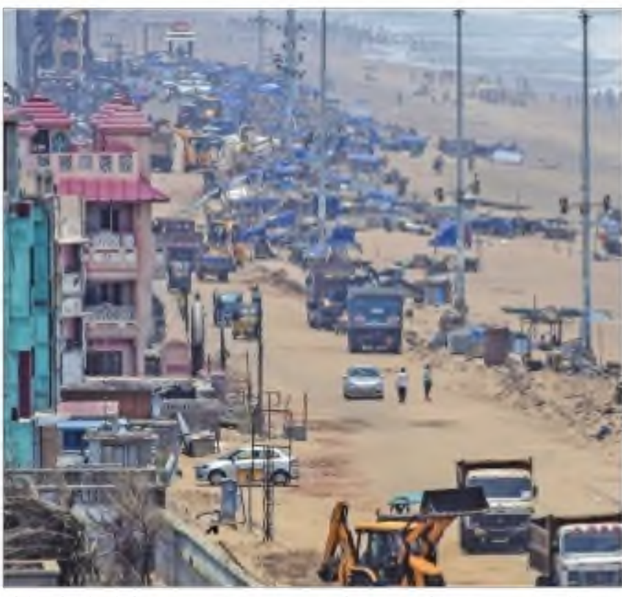
This photo taken on 12 May, 2019, shows a clean-up operation to repair beach side hotels and coastal facilities in Puri.

The meeting also resolved that more plasma cutters and power cutters should be stored in strategic locations which should be used immediately after a calamity strikes a region.