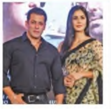
Actors Salman Khan and Katrina Kaif at the launch of Bharat, in Mumbai on Friday.

Acid attack in UP: A 45-year-old woman was allegedly raped and attacked with acid in Shahjahanpur by a man after she told him that she wanted to end their five-year-old affair, police said on Friday.