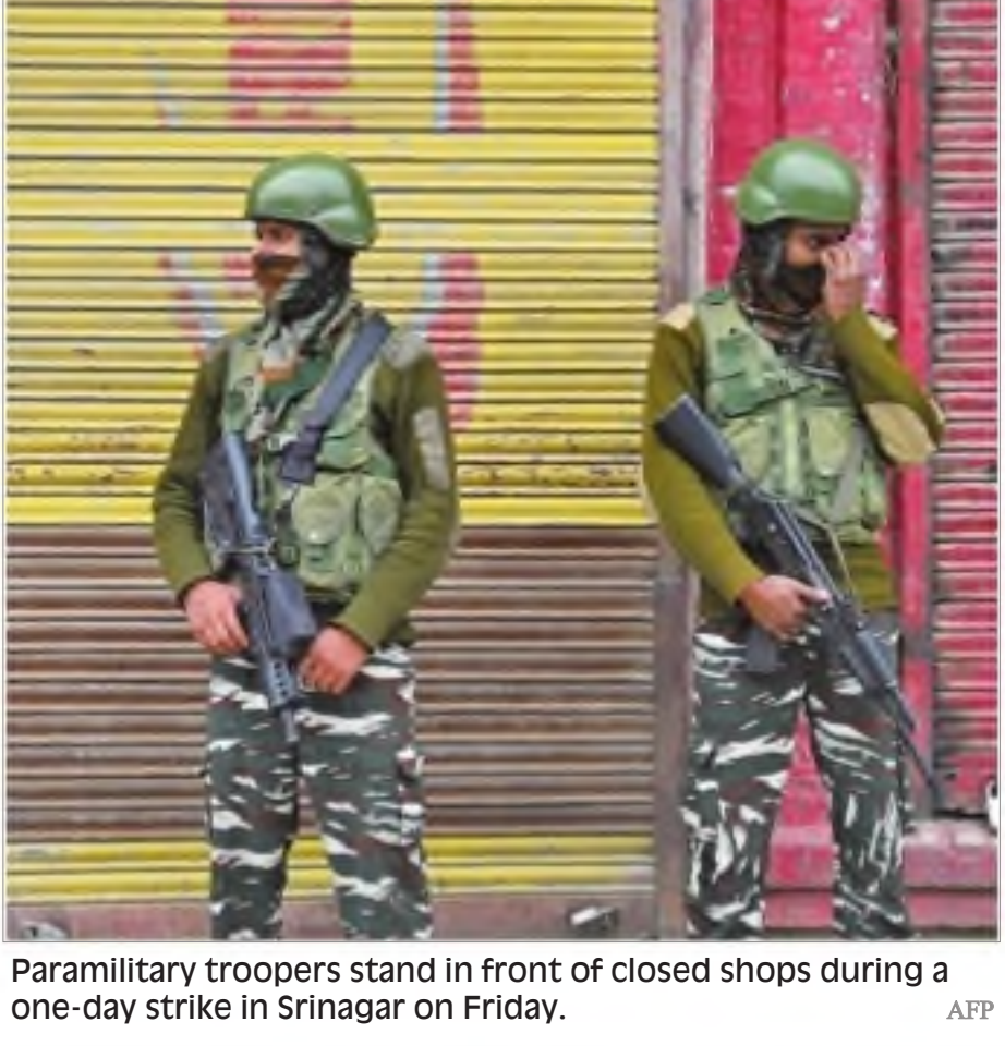
Paramilitary troopers stand in front of closed shops during a one-day strike in Srinagar on Friday.

Senior BJP leader and Union home minister Rajnath Singh says there is a need to review Article 370 and 35-A that grants special status to Jammu and Kashmir to establish whether these Constitutional provisions have benefited or done damage to the militancy-hit state.