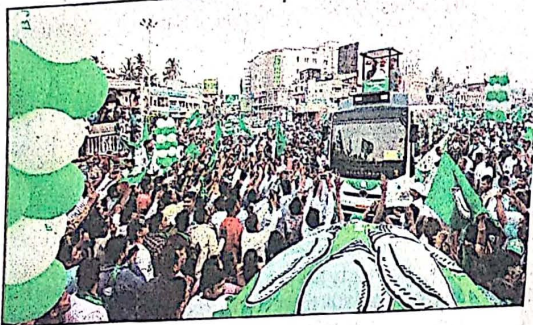
Odisha Chief Minister Naveen Patnaik in Puri.