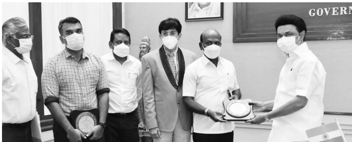
The Government of Tamil Nadu has bagged two awards for undertaking the highest number of non-communicable disease (NCD) screenings in the country and conducting the third highest number of wellness sessions during the Azadi Ka Amrit Mahotsav campaign. Health Minister Subramaniam, Secretary Radhakrishnan met Chief Minister Stalin and showed the awards in the presence of officials.