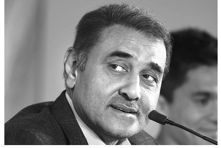
Praful Patel used the aircraft multiple times in 2012 when he was civil aviation minister

During the search in the case, ED has reportedly found incriminating documents revealing instances of siphoning of the funds and their misuse. Certain transactions are showing a clear diversion, such as a ₹98-crore loan from PMC Bank was diverted to M Estate Developers, a