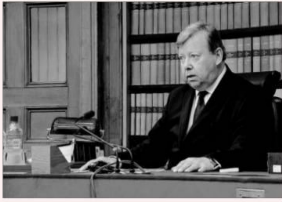
Lord Carloway, Scotland's most senior judge rules that British PM's decision to suspend Parliament is unlawful in this image taken from video on Wednesday

The court, in a short ruling, said that the purpose of the Prime Minister's move was to unlawfully "stymie" Parliament. The unanimous decision Wednesday by a panel of Edinburgh appeal judges will set up a showdown in the UK Supreme Court, which will take up the issue next week.