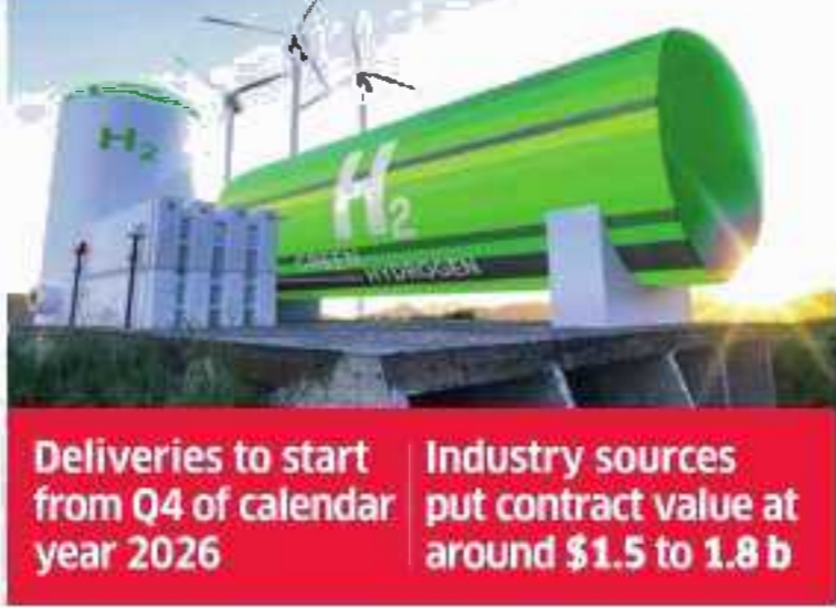
Deliveries to start from Q4 of calendar year 2026. Industry sources put contract value at around $1.5 to 1.8 b.

Greenko ZeroC is green ammonia production unit of AM Green. Oslo-based Yara Clean Ammonia is world's largest trader, distributor of ammonia. Two sign supply agreement from AM Green's facility in Kakinada on east coast. 10-year pact is for supply of 500,000 t green ammonia.