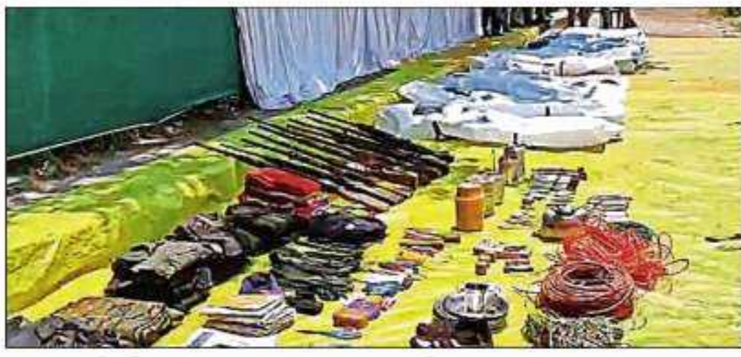
Arms and other items recovered during the encounter on May 10

Raipur: Two days after security forces claimed to have killed 12 Maoists in an encounter in Bastar division's Bijapur, local villagers, mostly women, marched to the district headquarters accusing police of a fake encounter. Innocent villagers were gunned down while collecting tendu leaves, they claimed.