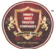
INDIA'S MOST TRUSTED COMPANY

Regd. Off: P. B. No.73, VIII/224, Market Road, Alwaye-683 101, Kerala, India Phone : Off : 0484 - 2626789 (6 Lines) Fact : 0484-2532186, 2532207 Fax : 0484 - 2625674 Web : www.cmrlindia.com E-mail : cmrlexim@cmrlindia.com, cmrlexim@dataone.in