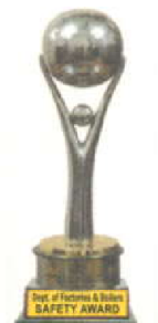
MEDIUM FACTORIES 2009 - FIRST PRIZE