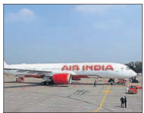
Air India placed a new order for 85 Airbus jets, including 10 A350s.

Three industry people aware of the matter said that Air India was the airline behind the order, which involves exercising options and comes barely a year