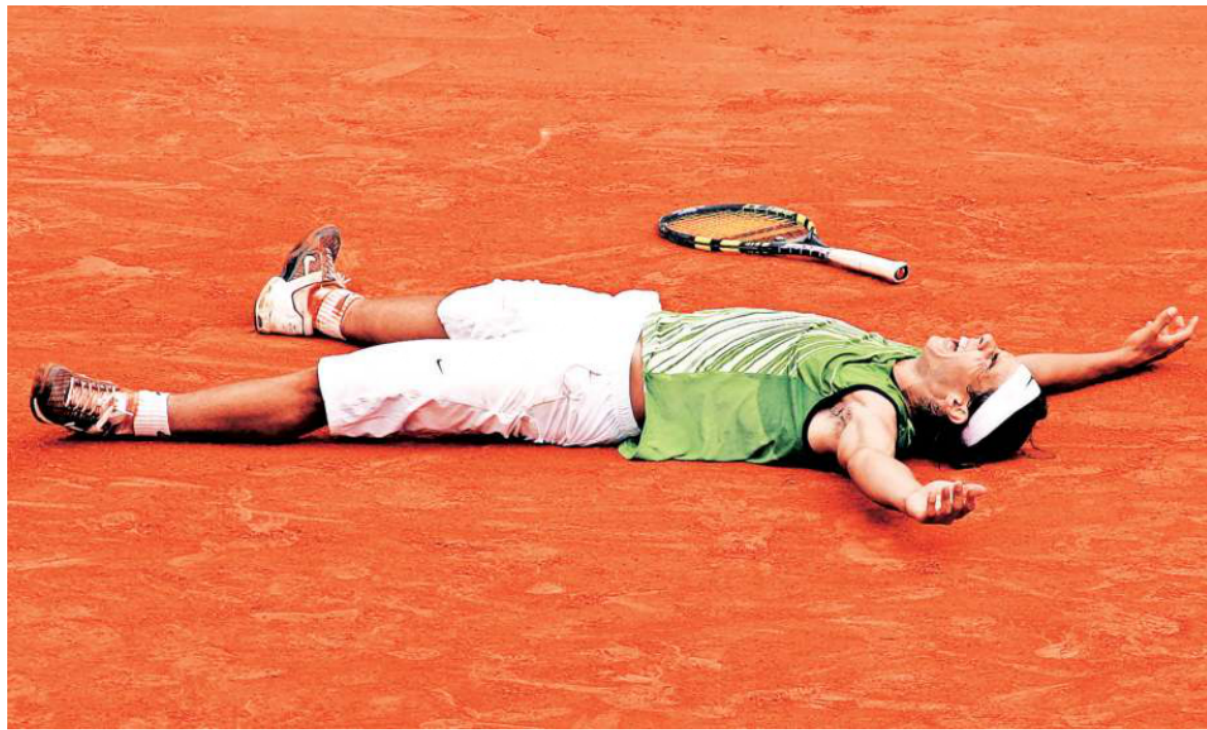
Nadal announced on Thursday that he is set to retire from professional tennis after the Davis Cup finals next month.

In the two-year, injury-induced lull of his career in 2015 and 2016, Nadal returned a changed player. The era of surface homogeneity - when tennis weapons became similarly effective throughout the bloated calendar, across all surfaces - had been ushered in by Nadal, alongside Djokovic and Andy Murray, and their aggressive baseline style. But to truly excel across the board, and contend with the myriad injuries he had faced, Nadal needed subtle variations and improvements that came about after a coaching change when he hired Carlos Moya.