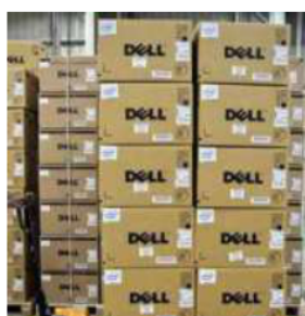
The US market bucked the global trend, posting a 5.6% growth with over 17 million PCs shipped.

Despite the setback, Gartner maintains a positive outlook for the PC market. "The