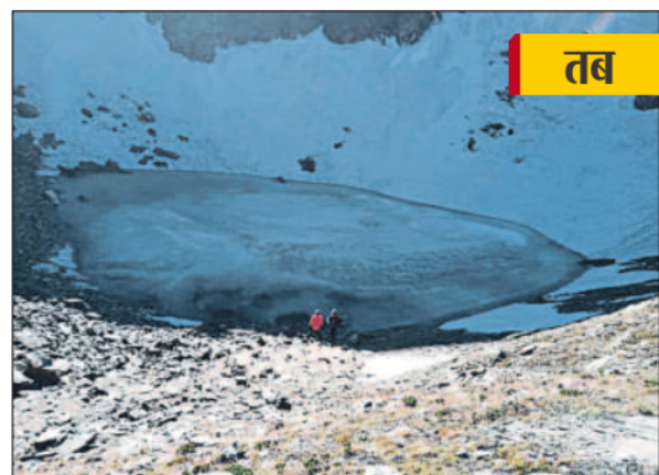
रूपकुंड में 2020 में पर्याप्त पानी और बर्फ होने से इस तरह का नजारा दिखाई देता था।

उत्तराखंड क्रान्ति मट्ट गोपेश्वर। प्रकृति प्रेमियों के लिए यह खबर निराश करने वाली है। जलवायु परिवर्तन का असर हिमालय में साढ़े 16 हजार फीट ऊंचाई पर स्थित रूपकुंड की सैहत पर भी पड़ा है। आस्था, इतिहास, पुरातात्विक रहस्यों का यह सरोवर इन दिनों पूरी तरह सूख गया है। कोई इसे आस्था से जोड़ रहा है तो कोई इसे ग्लोबल वार्मिंग का असर बता रहा है। रूपकुंड चमोली जिले में स्थित एक हिम झील है। यह स्थान पूरी तरह से निर्जन है। मान्यताओं के अनुसार कभी मां नन्दा (गौरी) ने हिमालय के इस सुंदर सरोवर को बनाया था। उत्तराखंड में लोक आस्था के प्रमुख प्रत्येक राजजात का यह प्रमुख केंद्र है। प्रत्येक बार वर्ष में आयोजित होने