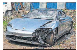
The Porsche car involved in the Pune crash.