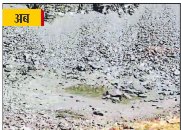
मौजूदा समय में रूपकुंड में न तो पानी दिखाई दे रहा है और न ही बर्फ।