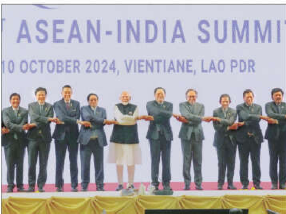
Prime Minister Narendra Modi at the 21st Asean-India Summit in Vientiane, Laos, on Thursday

"We are neighbours, partners in the Global South, and a rapidly growing region in the world. We are peace-loving