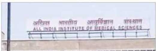
out-patient department admissions to general wards as well as private wards at the AIIMS hospital and all centres with immediate effect for a period of two weeks. The situation will be reviewed after that," said a letter from the hospital medical superintendent to all heads of departments.

"In view of the need to optimise usage of available inpatient beds for hospitalisation of seriously ill emergency/semi-emergency patients, it has been decided to temporarily stop routine