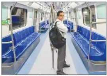
consider it to have hit peak capacity.

For instant patients, senior officials said, trains will be allowed to skip a station if crowds are deemed too large. Further, no further passengers will be allowed entry into a station if officials