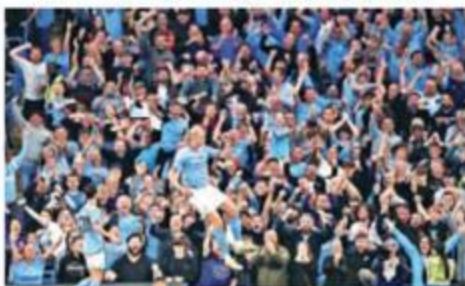
হ্যাটট্রিকের পরে উত্তর উল্লসে।