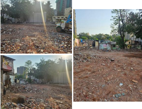
AMBIKA NAGAR SRA (JOGESHWARI EAST) PARTH CONSTRUCTION