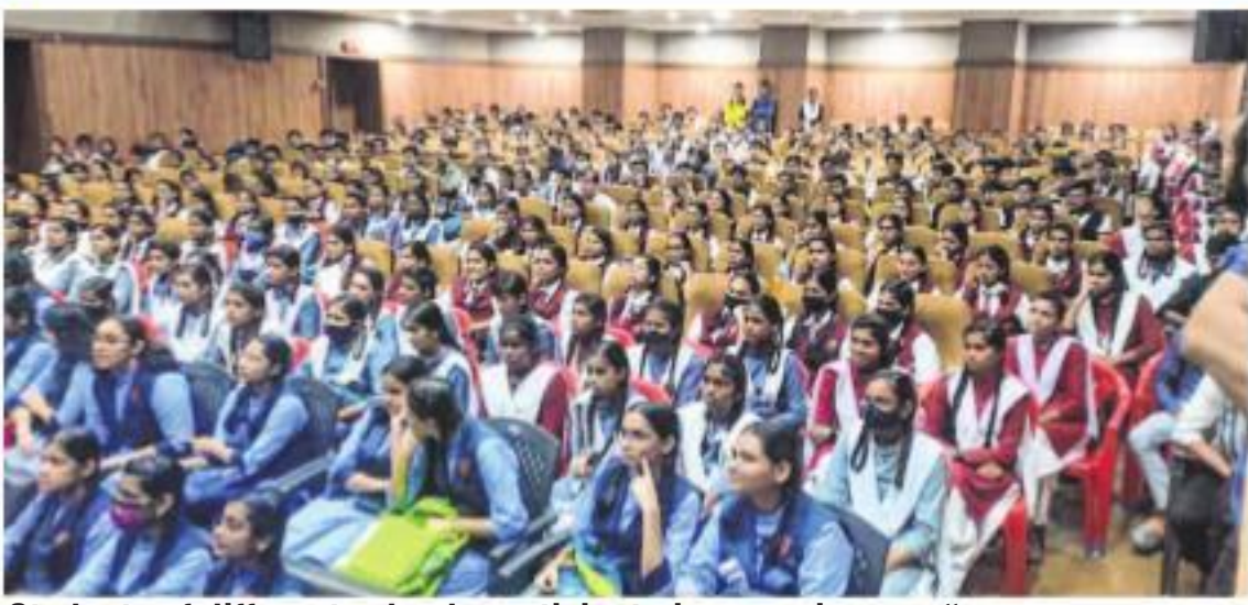
Students of different schools participate in a seminar on "career counselling and personality development" and "Kulpati ke sath samvad" programme in Ujjain on Friday.