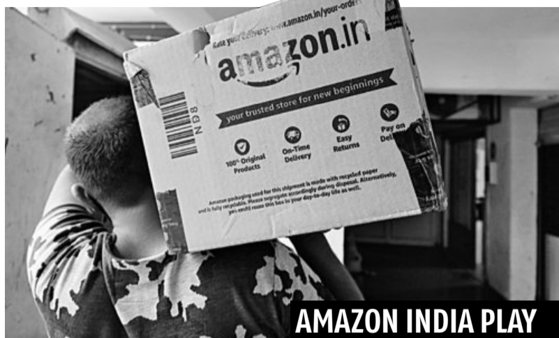
AMAZON INDIA PLAY

A tougher global e-commerce environment and repeated policy and regulation problems are raising questions about the company's India expansion plans