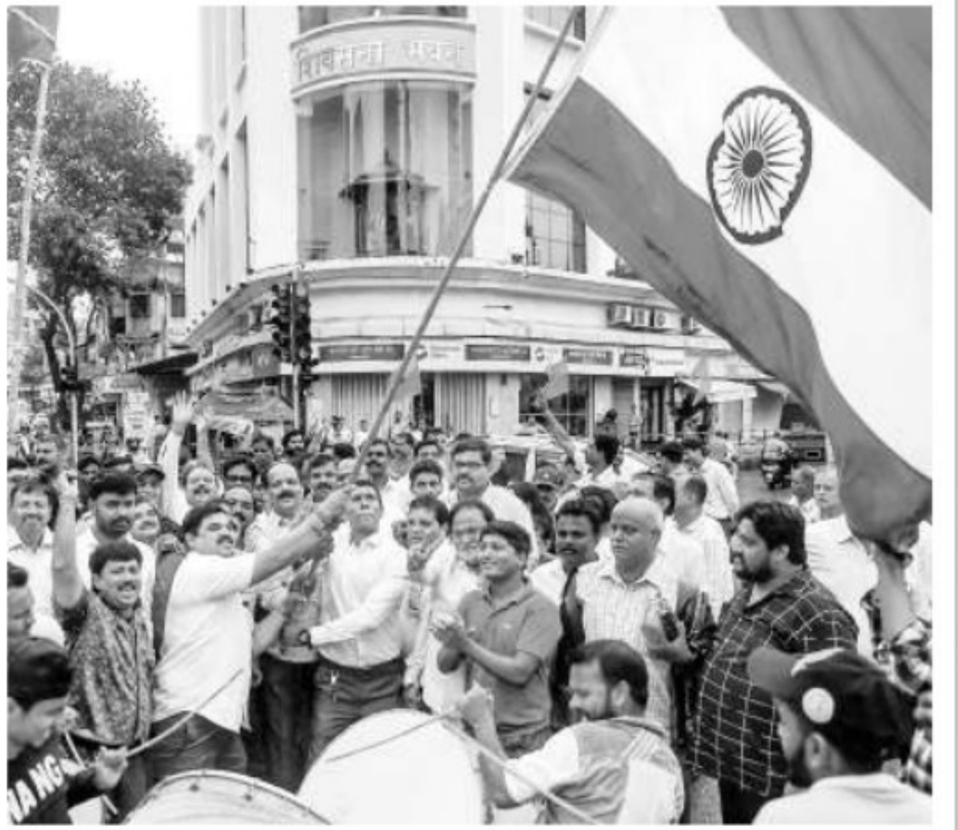
Shiv Sena workers celebrate governments decision to revoke Article 370 that gave special status to Jammu and Kashmir and a separate bill to bifurcate the state into two separate UT of Jammu and Kashmir and Ladakh in Mumbai on Monday