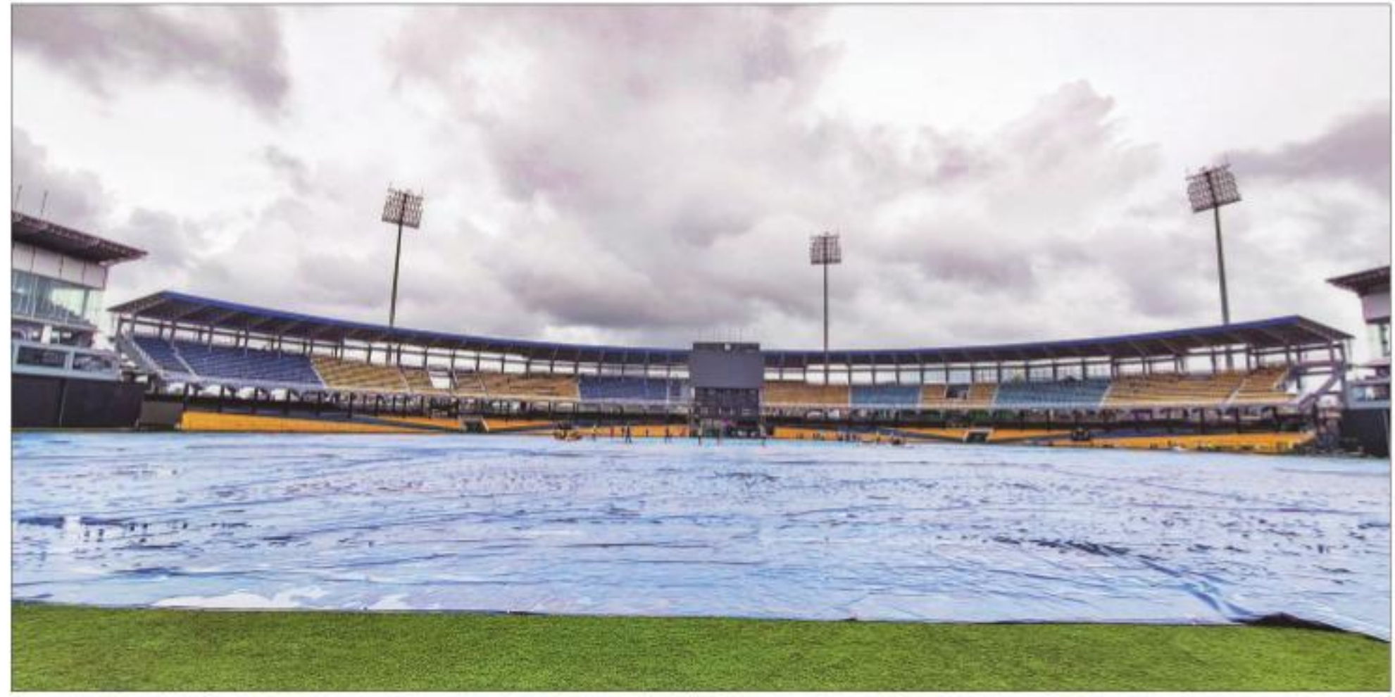
Colombo on Sunday, the uncertainty around the weather continues. There are also concerns about the conditions on offer at the R Premadasa Stadium as heavy rains are understood to have affected pitch preparation.