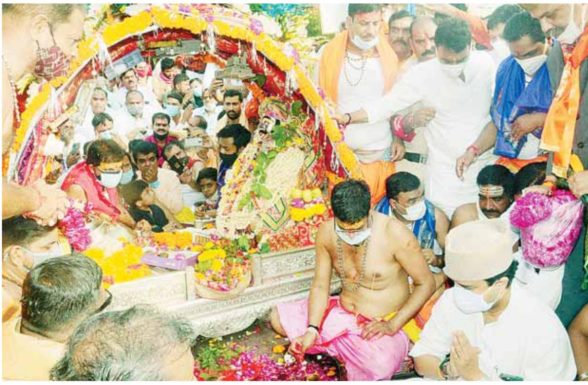
उज्जैन। मादो मास में भक्तों को दर्शन देने निकले बाबा महाकाल। केंद्रीय मंत्री ज्योतिरादित्य सिंधिया ने भी पूजा अर्चना की।