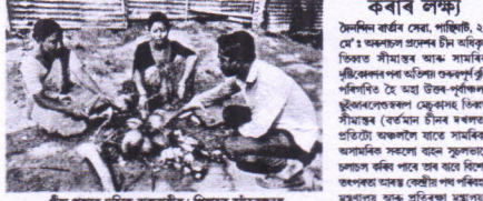
শিশু সেৱাৰ বাবে বৰ্তনীয় পৰামৰ্শ। শিশুৰ আত্মসম্বন্ধ বৰ্তনীয় পৰামৰ্শ দিয়াৰ সময়ত, বৈশিষ্ট্য

অৰ্থ আইনী, ৰাজ্যিক আইন সেৱা প্ৰাধিকাৰী, জিলা সৈনিক সেৱা প্ৰাধিকাৰীক প্ৰশংসা স্থানীয় বাইজৰ সৈনিক সেৱা প্ৰাধিকাৰীক প্ৰশংসা স্থানীয় বাইজৰ সৈনিক সেৱা প্ৰাধিকাৰীক প্ৰশংসা স্থানীয় বাইজৰ সৈনিক সেৱা প্ৰাধিকাৰীক প্ৰশংসা স্থানীয় বাইজৰ