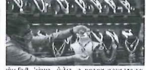
ચોટીના વાહાઈઓમાં ચોટી કિલોલીટ ૩.૬૨૨૧૯ મુલતી...