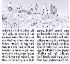
જમીનને હુંગોમાં પરિવર્તન કરી માટીની ઝાપી...