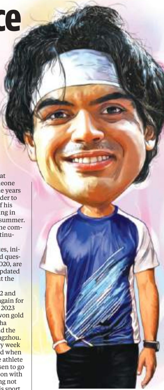
ILLUSTRATION: BINAY SINHA

cessful at it; they should play to enjoy it and learn from it.