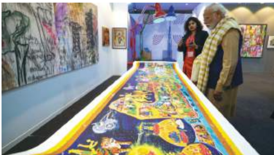
Prime Minister Narendra Modi at the first Indian Art, Architecture and Design Biennale 2023, at Red Fort on Friday

She said Prime Minister Modi had given a call for such an event in 2020, adding that governments are increasingly realising their soft power, particularly in regions like West