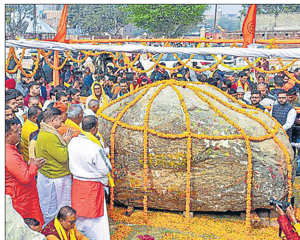
People offer prayers near one of the Shaligram stones which is likely to be used to make the idol of Lord Ram after it reached Ayodhya from Nepal on Thursday.