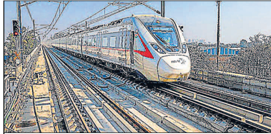
दुहाई से मुरादनगर के बीच ट्रैक पर दौड़ती रैपिड रेल।