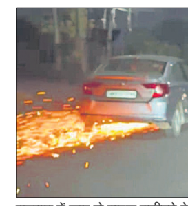
गुरुग्राम में कार से बाइक घसीटने के दौरान निकलती चिंगारी।

दौरान कार चालक बाइक समेत कार को गोल्फ रोड की तरफ घसीटता हुआ गया और करीब चार किलोमीटर तक घसीटता रहा। इससे रोड पर चिंगारी निकल रही थी। तभी वहां गड़्डे से बाइक हट गई और कार चालक फरार हो गया।