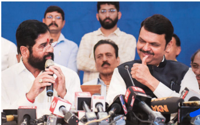
Maharashtra Chief Minister and Shiv Sena leader Eknath Shinde (left) and Deputy Chief Minister Devendra Fadnavis at a press meet, in Mumbai on Thursday

tion could ensure that a 'Shiv Sainik' would be the next chief minister, Thackeray had said while battling the rebellion by majority of party MLAs which began more than a week ago.