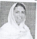
निरंकारी संत समारोह की तैयारियों का शुभारम्भ हुआ है।

नई दिल्ली (विशेष) । दिल्ली सरकार की 74वें वार्षिक निरंकारी संत समारोह की तैयारियों का शुभारम्भ हुआ है। निरंकारी संत समारोह की तैयारियों का शुभारम्भ हुआ है।