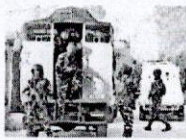
According to a police spokesman, the first counter terrorist operation was launched by the security forces in the Chancer Chawalgam area of Kulgam late Thursday evening. In the initial gunfight one terrorist was neutralized and the second one was eliminated in the few hours of Friday. The slain terrorists have been