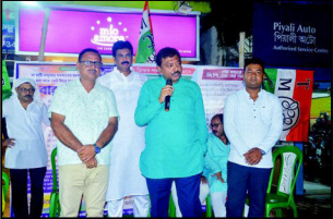
১৯ বিকাশ কার্যে প্রবেশ করছেন প্রধান।