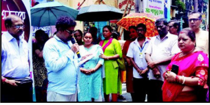
১৯ বিকাশ কার্যে প্রবেশ করছেন প্রধান।