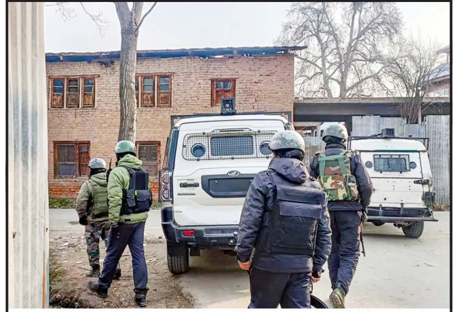
જમ્મુ-કાશ્મીરના કુલગામ જિલ્લામાં સુરક્ષાદળોના સર્ચ ઓપરેશન દરમિયાન હડીગામમાં છુપાયેલા આતંકવાદીઓ અને સુરક્ષા દળો વચ્ચે અથડામણ સર્જાઈ હતી. એક મકાનમાં છુપાઈને આતંકવાદીઓએ સતત ગોળીબાર કરતાં સમગ્ર વિસ્તારને ઘેરી લઈને સુરક્ષાદળના જવાનો પોઝિશન લઈ રહેલા નજરે પડે છે.

મસ્કનું કહેવું છે કે, સેટેલાઈટની મદદથી નેટવર્કની સમસ્યા દૂર થશે. આ બીમ દીઠ 7Mb પણ પ્રદાન કરશે અને ઝડપની ટ્રિપ્લે બીમ વધુ ઝડપી છે. આવી સ્થિતિમાં, બંધ નેટવર્કની સમસ્યા હોય તેવા સ્થાનો માટે આ એક શ્રેષ્ઠ ઉકેલ હોઈ શકે છે. હવે ઉપલબ્ધ નેટવર્ક માટે આ સૌથી મોટા પડકાર તરીકે ઉભરી આવશે. એલોન મસ્કની બહેરાતથી તે સ્પષ્ટ થઈ ગયું છે કે તે મોબાઈલ નેટવર્ક પર ઘણું કામ કરી રહ્યો છે.