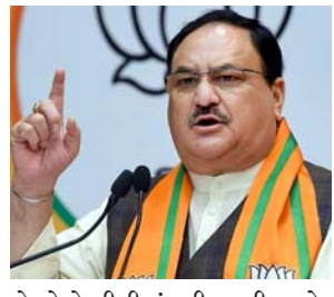
રાજ્યસભાના માર્ગે કેન્દ્રીય કેબિનેટમાં રહેલા અનેક મંત્રીઓને પણ બેઠક પસંદ કરવા જણાવાયું: 'દિલ્હી' કોઈને નહીં મળે

એલોન મસ્કની મદદથી નેટવર્કની સમસ્યા દૂર થશે. આ બીમ દીઠ 7Mb પણ પ્રદાન કરશે અને ઝડપની ટ્રિપ્લે બીમ વધુ ઝડપી છે. આવી સ્થિતિમાં, બંધ નેટવર્કની સમસ્યા હોય તેવા સ્થાનો માટે આ એક શ્રેષ્ઠ ઉકેલ હોઈ શકે છે. હવે ઉપલબ્ધ નેટવર્ક માટે આ સૌથી મોટા પડકાર તરીકે ઉભરી આવશે. એલોન મસ્કની બહેરાતથી તે સ્પષ્ટ થઈ ગયું છે કે તે મોબાઈલ નેટવર્ક પર ઘણું કામ કરી રહ્યો છે.