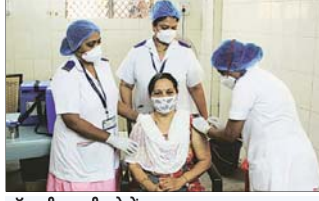
अंपगधील चुकींुते केद्रावर ताण वांे चुकींुत संकुलगातील (सोकीनी) लसीकरण केद्रावर १८ ते ४४ खणेदातील १०० लखडरवेर ४५ र्ग्यांतदिल एक हजार जणांल लसीकरणसाठी येण्याच संदेश पावडिला होता. या यतिरिक्त जखजखपण १३०० नागरिकांला पहिली आणि दुसरी मात्रा घेण्याचा संदेश अंपगडू पावडिला गेला. रग्ग्याते होलेल केद्रावर आल्याने रग्गीनी चांचणीच रग्गीक असली. अर्वाच्या १३०० लोकांल परत पावडिले शक्य नासल्याने पाकिेच्या परगळाले उरवल्यात १८ ते ४४ र्ग्यांच्या लसीकरणाला साधलंतील त्यात जालर्या आणि लसीकरण केले, असे केद्रावरील डॉक्टरांनी सांगिले. वरवील केद्रावर धोरकुल ठेवताळ पोलीस आणि रग्गाल व रग्गीणी बाळकेऊ आले.

पहिली मात्रा घेणाऱ्यांचीही उपस्थिती, अनेक जण लस न घेताच माघारी