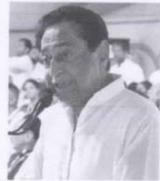
been completed. Voting is to be held in the remaining five phases on April 19, April 26, May 7, May 13 and May 20. Non-voting will be held in the coming days on 23rd May and 1st June...