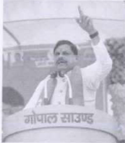
have been built in Ayodhya, but for 70 years Congress kept questioning the existence of Lord Shri Ram kept asking for proof of his existence...