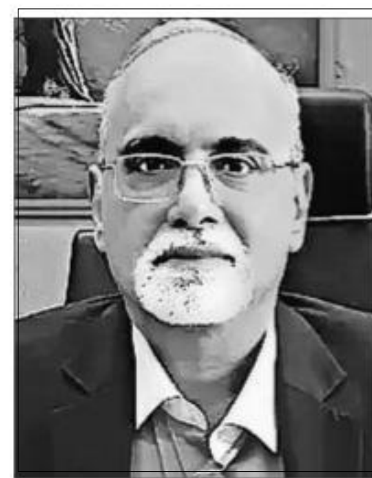
Reserve Bank of India deputy governor Rajeshwar Rao asked NBFCs to be mindful of their underwriting practices

regulations for NBFCs, especially in the upper layer, are much more calibrated, but are not certainly at par with the regulations applicable to banks," Rao said.